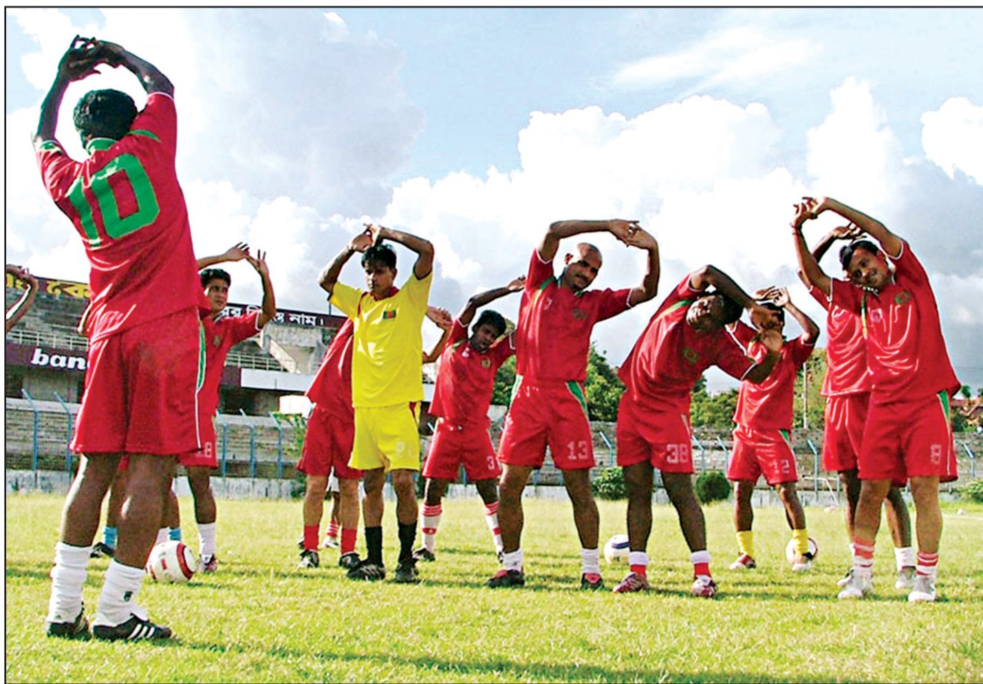
Bangladesh football team players stretch before their training session ahead of their AFC Asian Cup qualifying round match against Qatar at the MA Aziz Stadium on Monday.