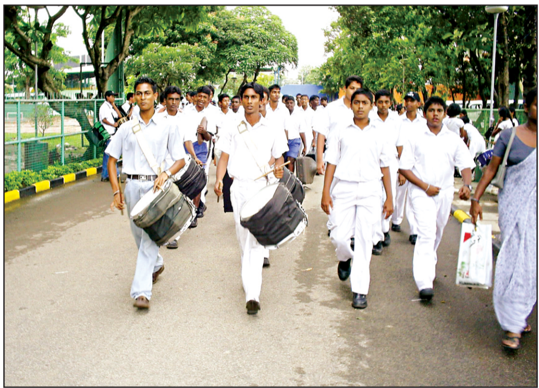
Boys rehearsing for the opening ceremony of the South Asian Games outside the main entrance at the Sugathadasa Stadium in Colombo yesterday.

The only new venue built for the Games is the Walisara Navy Shooting Range on the outskirts of the city.