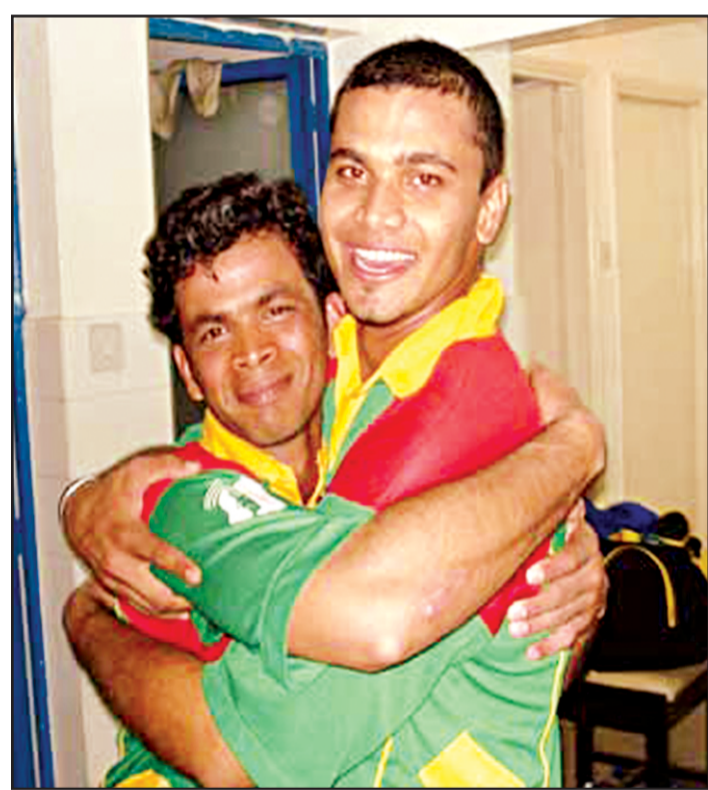
Mashrafe Bin Mortaza (R) and Abdur Razzak are unable to hide their happiness inside the dressing-room after taking Bangladesh to victory in the second one-day international against Kenya at the Nairobi Gymkhana ground on Sunday.