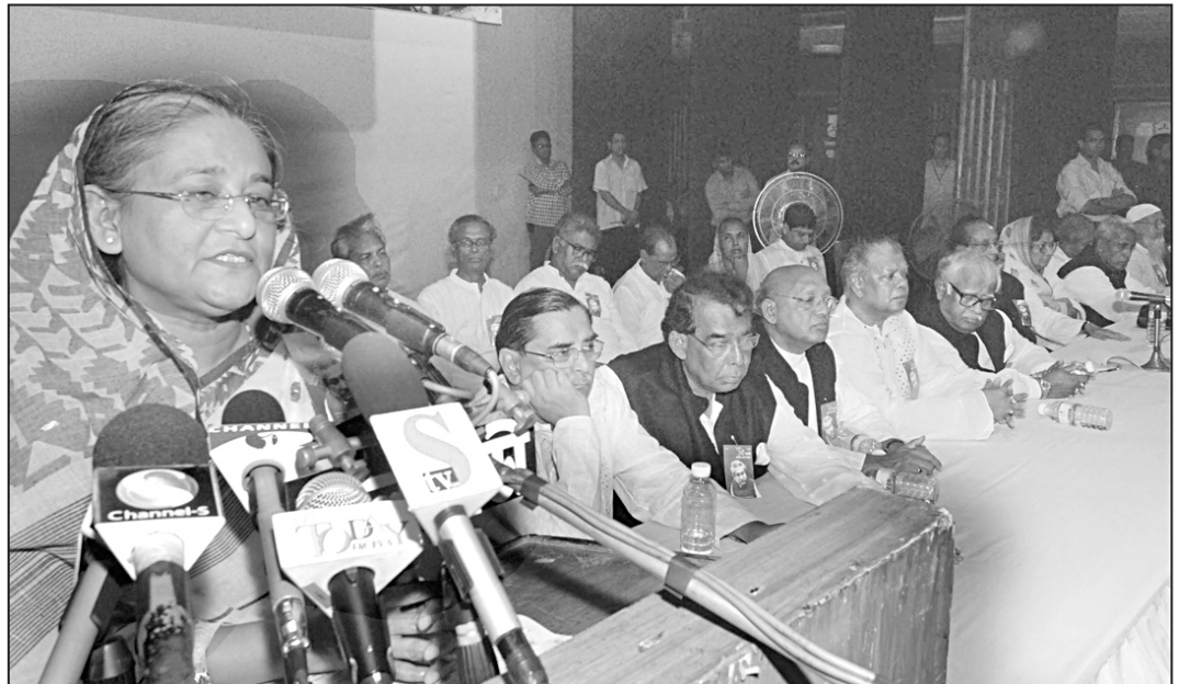
Awami League President and Leader of the Opposition in Parliament Sheikh Hasina speaks at a discussion at Engineers' Institution auditorium in the city yesterday. AL organised the discussion to mark the National Mourning Day.

Relatives and admirers have been requested to attend the programmes.