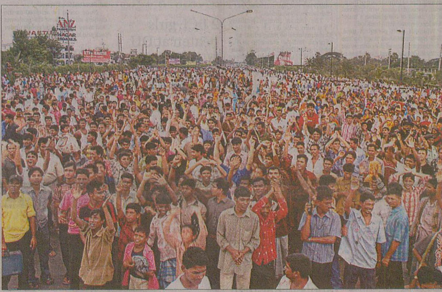
Garment workers barricade the Airport Road at Khilkhet for hours yesterday demanding pay raise and end to 'inhuman treatment' at their workplaces.

Border Security Force (BSF) of India gunned down two more Bangladeshis and injured another on Boichuna border under Pirganj upazila of Thakurgaon district yesterday morning, according to Bangladesh Rifles (BDR) sources. The dead were identified as Md Saiful Islam, 30, son of Tahiruddin of village Kurumia, and Shukumar