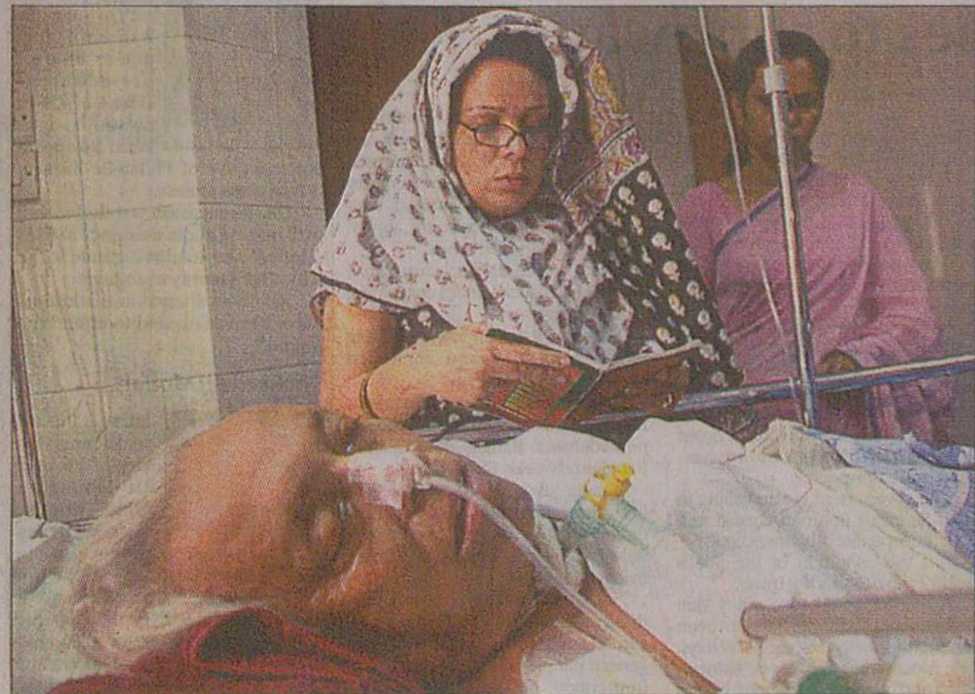
Daughter of Shamsur Rahman recites from the Quran as the ailing poet lies on a bed at the intensive care unit of Bangabandhu Sheikh Mujib Medical University Hospital yesterday.

Ershad met the prime minister to discuss about the cases filed against the deposed dictator HM Ershad, and the easiest way to dispose of those cases. The judgement in a case against Ershad is scheduled to be pronounced on August 17. Roushan, wife of Ershad met the prime minister at the Prime Minister's Office yesterday afternoon and discussed the present