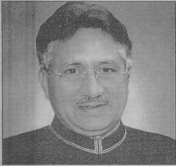
General Pervez Musharraf President of the Islamic Republic of Pakistan