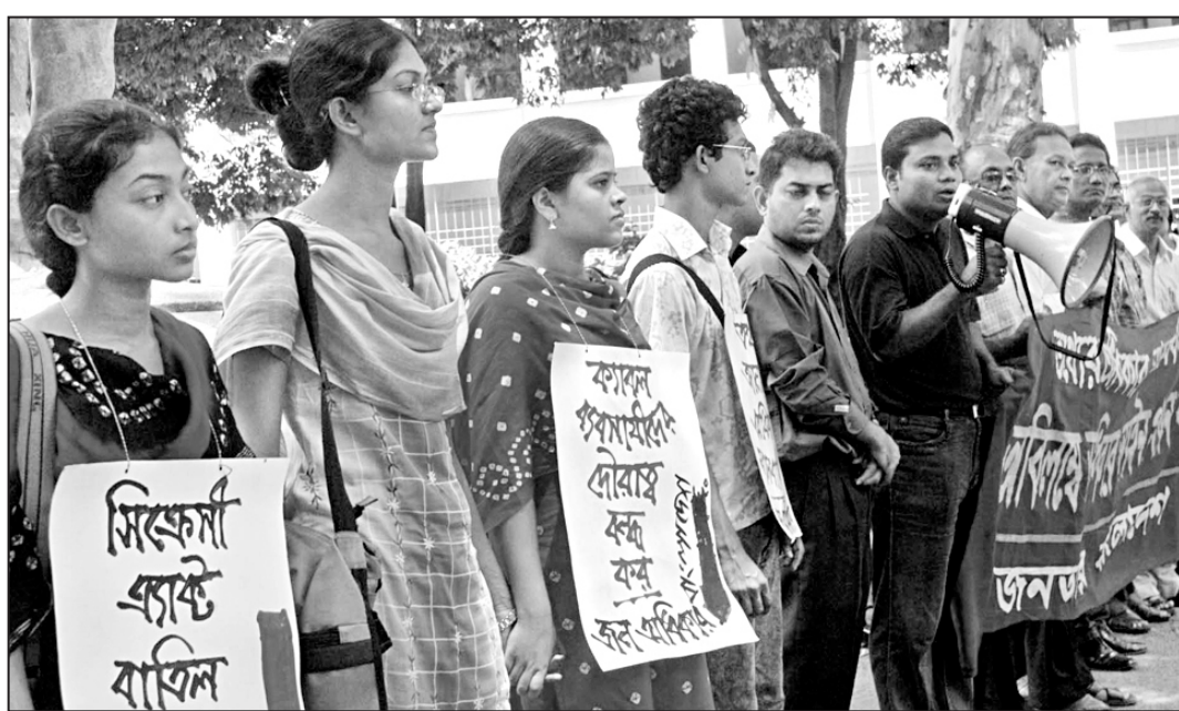
Jono Adhikar forms a human chain on Dhaka University campus yesterday demanding repeal of Official Secrets Act.

Thousands of people in Mongla, Sarankhola and Morelganj upazilas have been reportedly marooned following the flash flood.