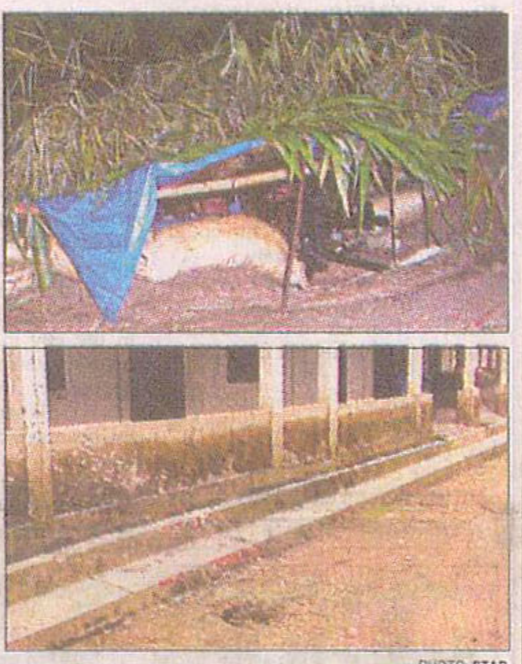
Residents of Zakiganj border area flee homes fearing more fighting between the BDR and BSF; BDR personnel on vigil at a camouflaged machinegun-nest on the border; A building with marks of splinters after an Indian mortar shell hit it.