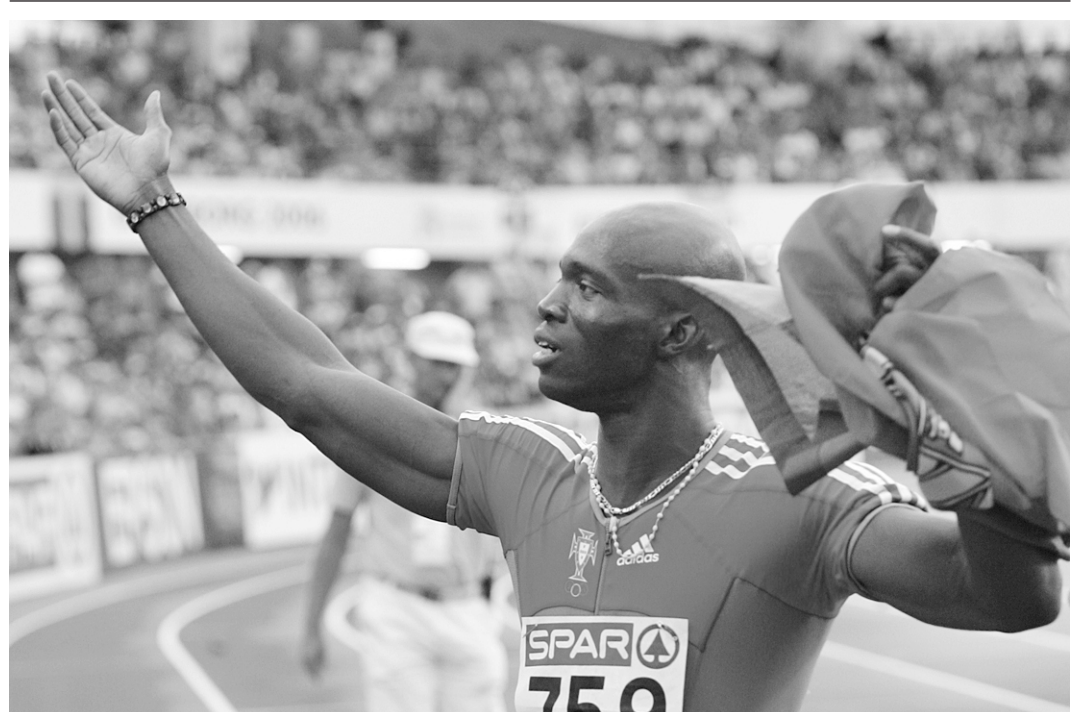
Portuguese sprinter Francis Obikwelu holds the flag after winning the 100m final at the 19th European Athletics Championships in Gothenburg on Tuesday.

he will go to the club that pay us best," he warned at the Lega Calcio meeting in Milan. The 24-year-old, who landed in Turin from Ajax in 2004 for £11.5m, has expressed his desire to leave Juventus following their demotion in Serie B.