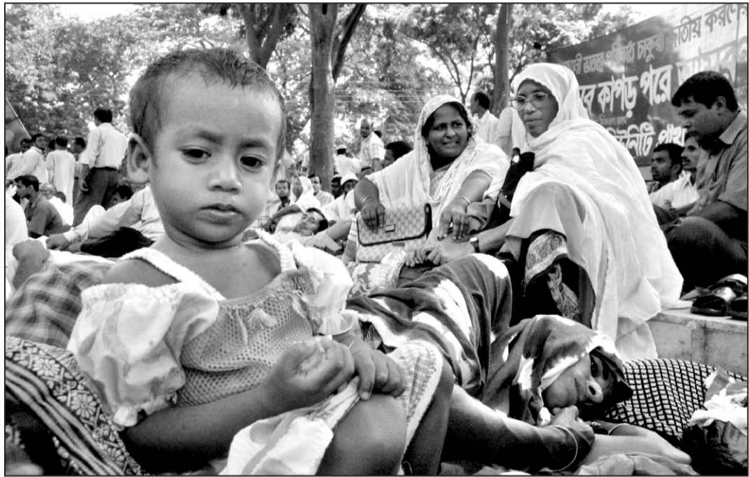
Community primary teachers continue fast-unto-death with their infants at Central Shaheed Minar in the city yesterday demanding nationalisation of their jobs.