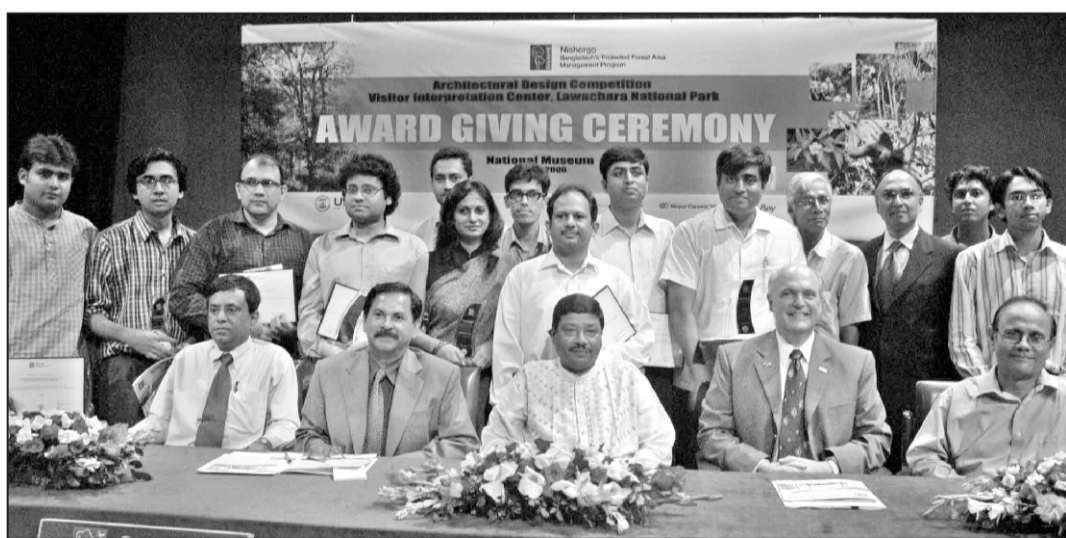
The winners of Nishorgo Support Project's Architectural Competition pose for photograph at National Museum auditorium in the city yesterday. State Minister for Environment and Forest Jafrul Islam Chowdhury and United States Embassy Charge d' affaires Gene V George were also present.

He also stressed the need for enhancing law enforcing agency's drive in the hill areas to save peace and harmony.