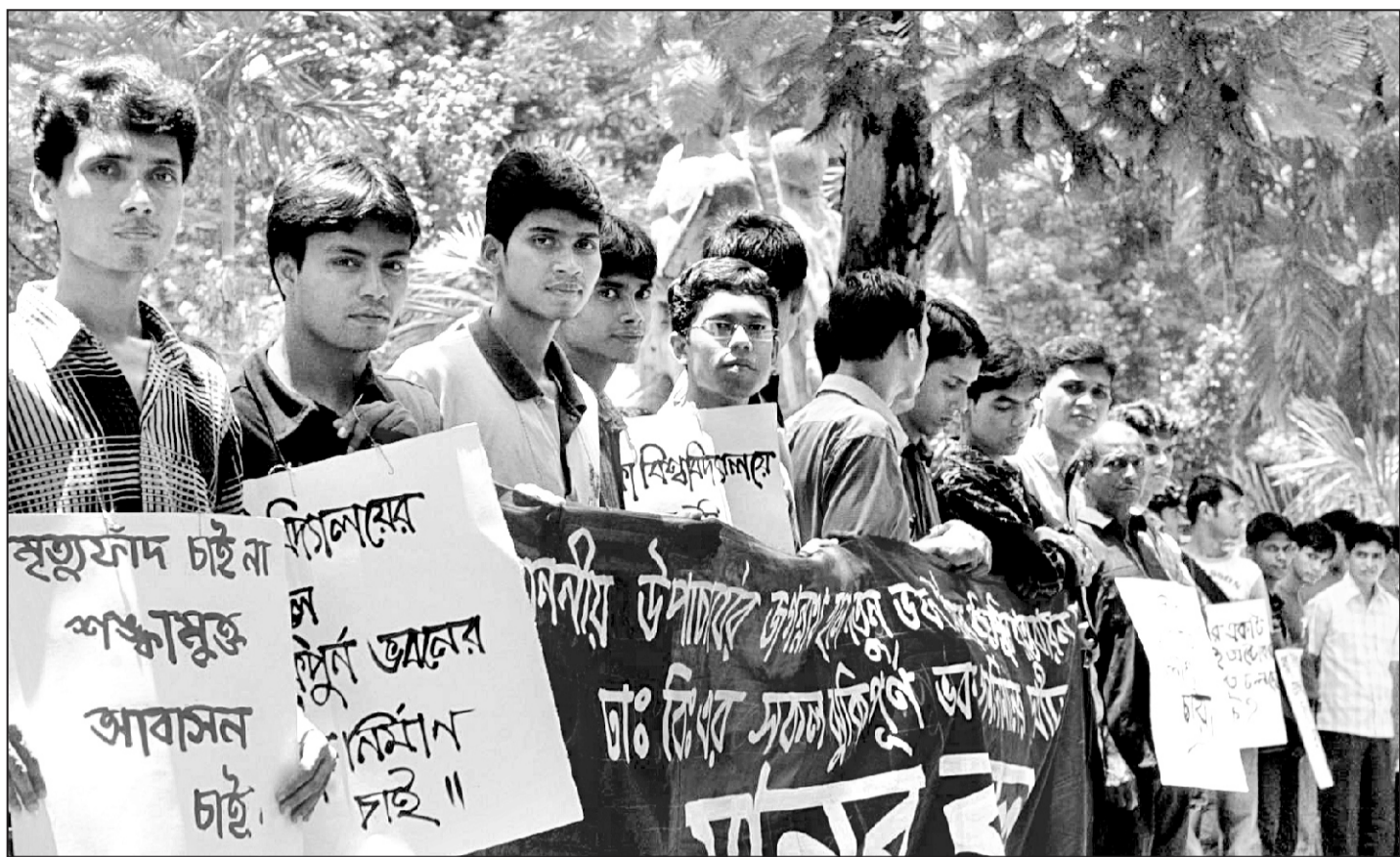
Students of Dhaka University form a human chain at the foot of the Aparajevo Bangla yesterday demanding construction of new buildings and renovation of the old ones.

The Indigenous Peoples' Day has been observed in 70 countries since 1995 to highlight the rights of the ethnic people.