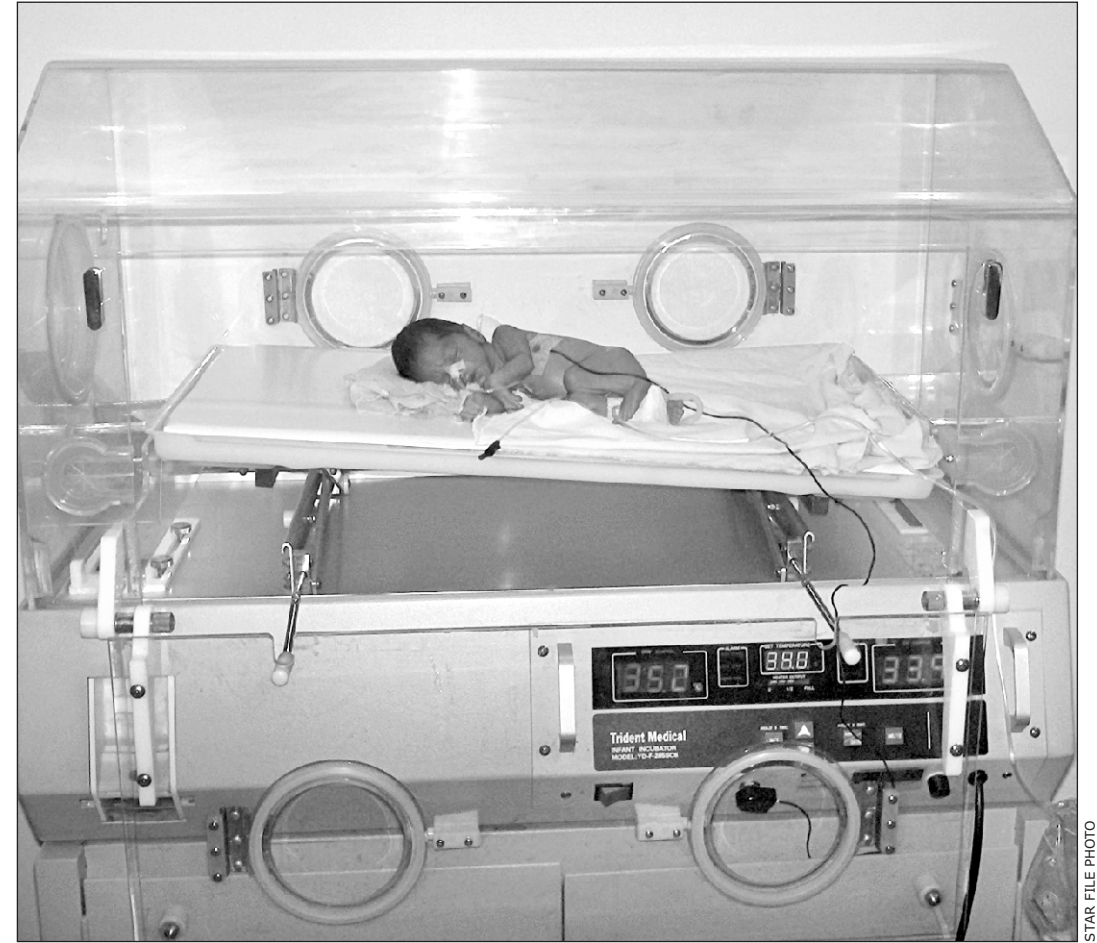
renovation work of neonatal ward is going on. "The two incubators that have been repaired are kept wrapped in the department. Soon after the renovation is completed we will use them," he said.

is absolutely free. The doctors in the department said there is no hope of getting a new incubator or repairing the available ones in near future if the higher authorities do immediate action. "It usually takes more than a year to complete procedures to buy something for the department. We sent our requisition three months back. The director has forwarded it to the CMSD and now we have to wait," said a doctor. The doctors in the department said they supply