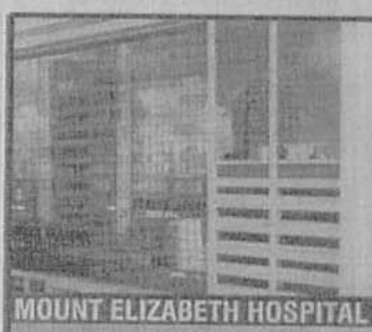
MOUNT ELIZABETH HOSPITAL

DHAKA OFFICE: Suite B-3, Level-4, House 10, Road 53, Gulshan-2, Dhaka-1212, Bangladesh Phone: 885 0422, 885 0423, Fax: +880 2 885 4056 E-mail: zahidkhan@parkway-dmrc.com, jessicasim@parkway-dmrc.com web: www.pgh.com.sg