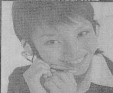
EAST SHORE HOSPITAL