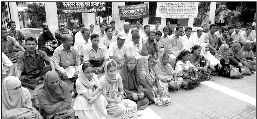
Bangladesh Community Primary Teachers' Association begins a hunger strike at Central Shaheed Minar in the city yesterday to press for its demand for nationalisation of their jobs.

He was rushed to Dhaka Medical College Hospital where doctors declared him dead.