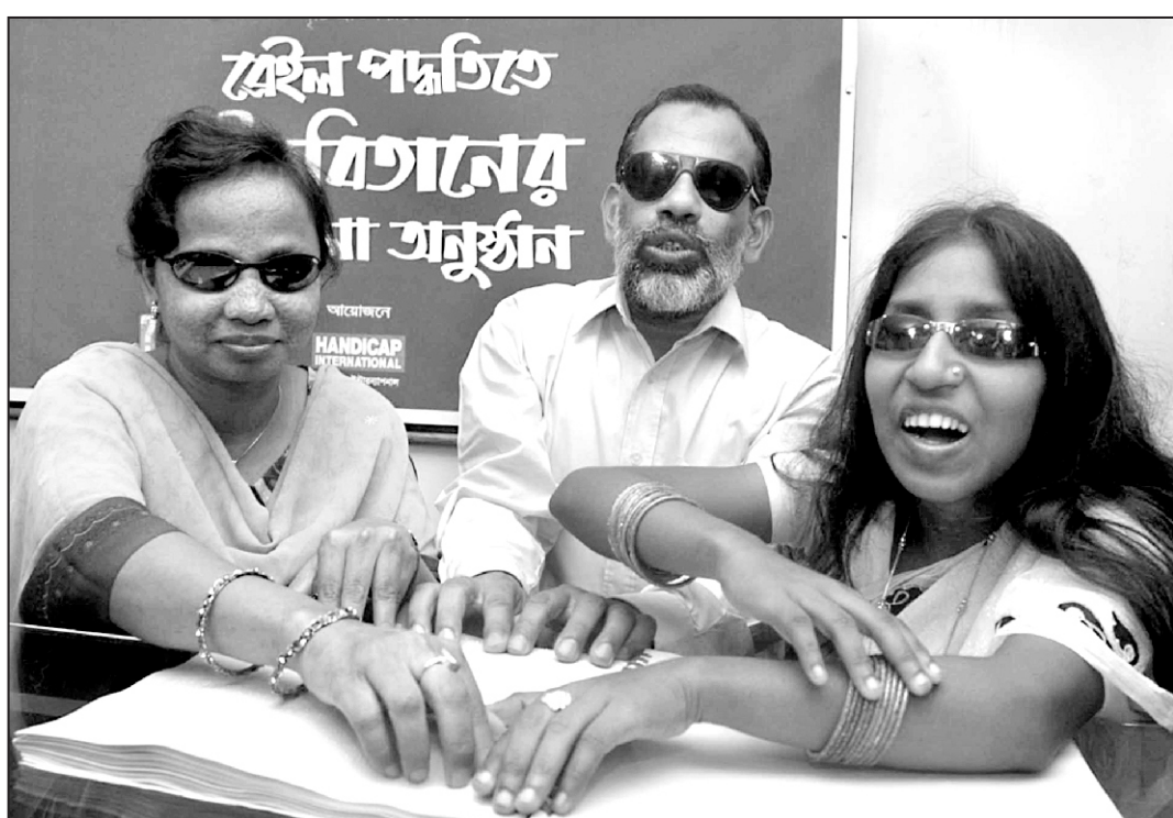
Three visually impaired people sing at a publication ceremony of a book 'Geetobitan' by Rabindranath Tagore at Dhaka Reporters' Unity auditorium yesterday. The book was published in Braille.

A large number of people, including the relatives of Sohrab, gathered on both sides of the river during the search.