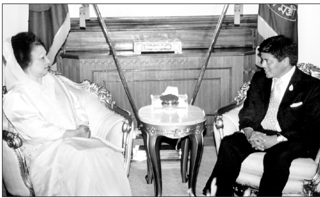
Thai Foreign Minister Dr Kantathi Suphamongkhon calls on Prime Minister Khaleda Zia at her office yesterday.

The organisers said the website is aimed at empowering the voters with adequate information about the political parties and their candidates so that the voters can make a more informed decision while choosing their representatives.