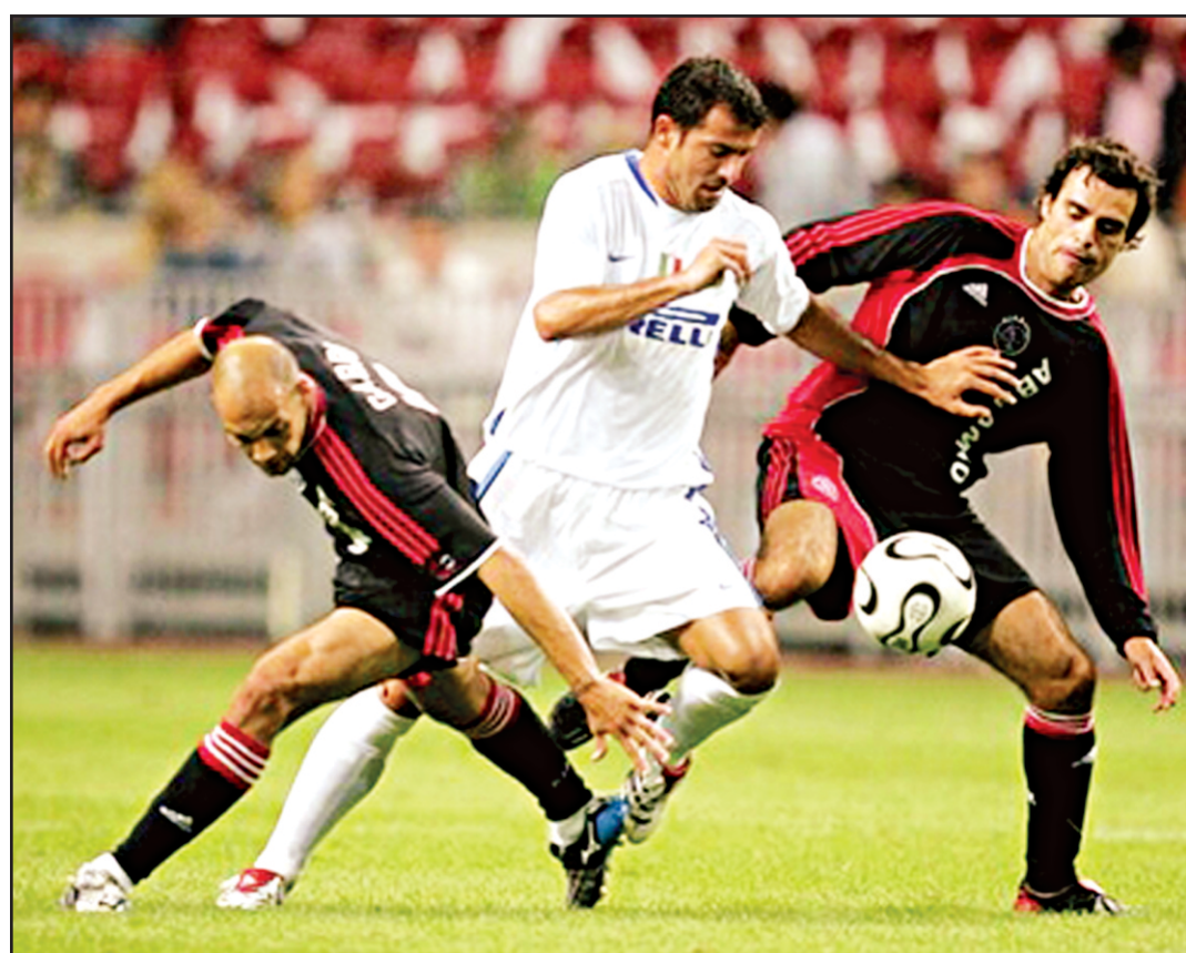
Inter Milan midfielder Dejan Stankovic (C) tries to wriggle between two Ajax defenders during their match of the Amsterdam Tournament in the Arena on Friday.

The Amsterdam Tournament is held every summer and this year sees Inter, Ajax, Porto and Manchester United challenge for the trophy.