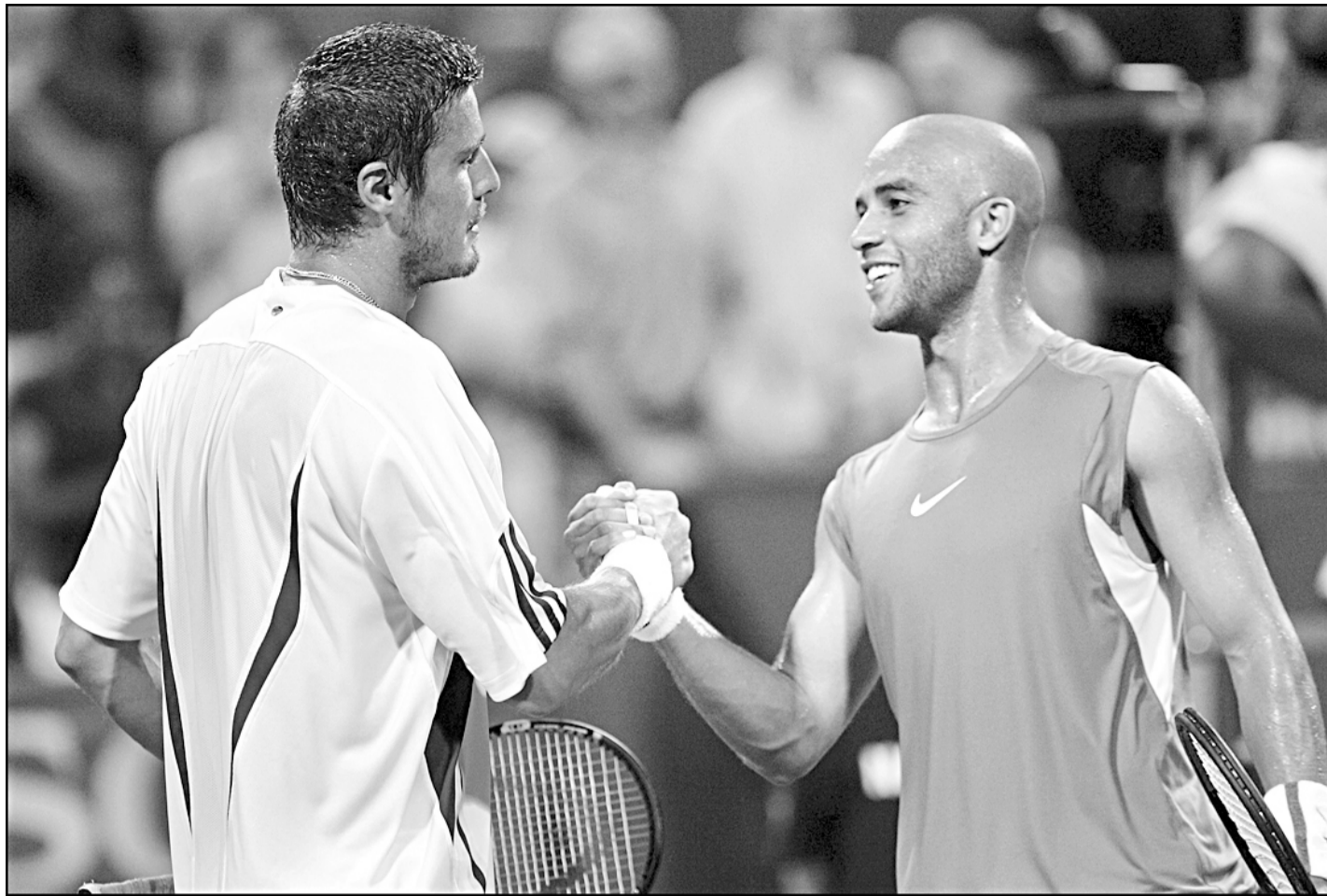
Marat Safin of Russia (L) is congratulated by American James Blake after his 7-6 7-6 win in the Legg Mason Classic at the William H.G. Fitzgerald Tennis Center in Washington on Thursday.

"Over the time I have been at the club, we have had to build four or five teams. It's not always easy, but this team we are trying to build will hopefully stay together for a few years."