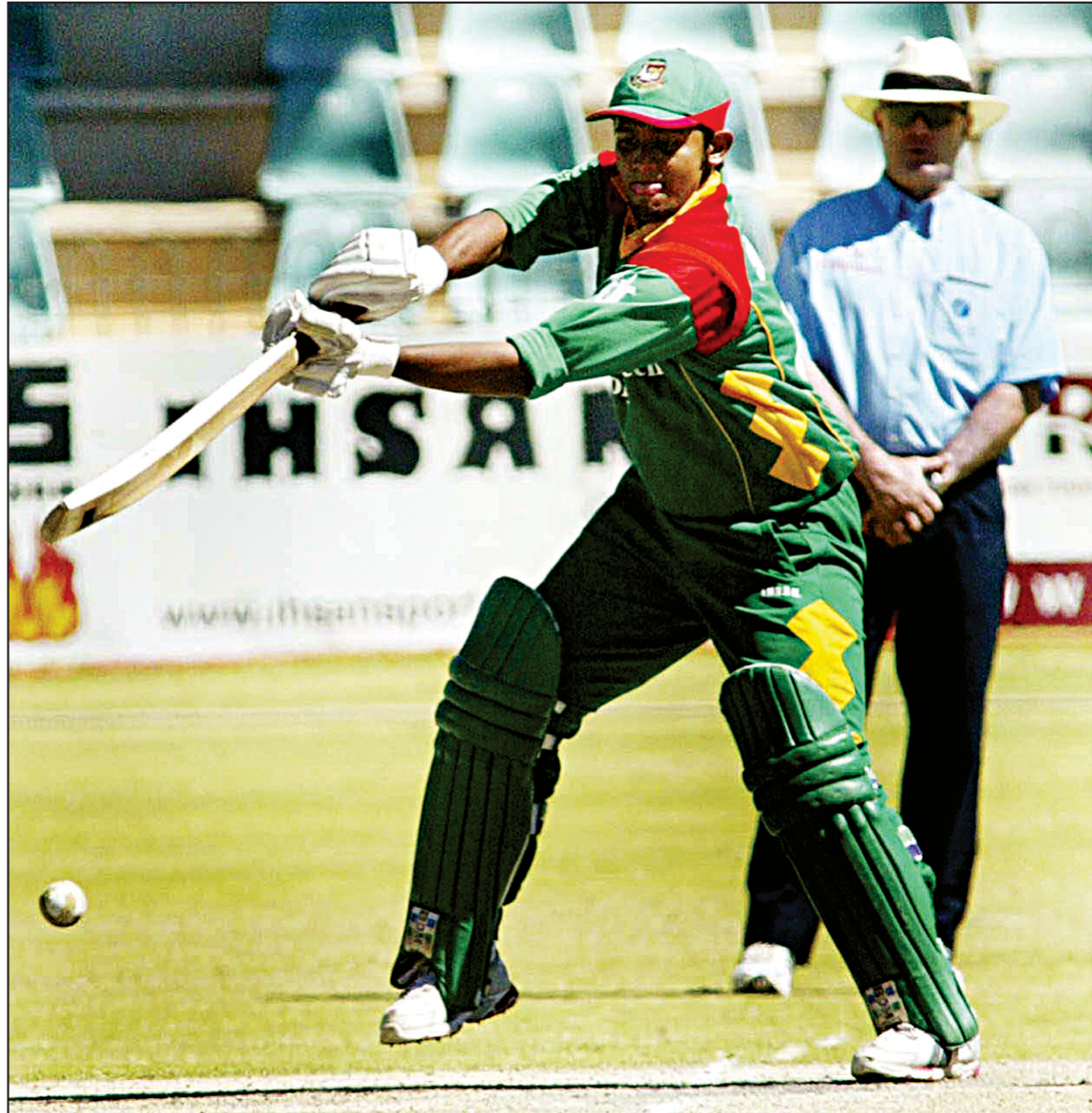
Bangladesh batsman Shahriar Nafees plays on the off-side against Zimbabwe during the fourth one-day international at the Harare Sports Club ground on Friday.