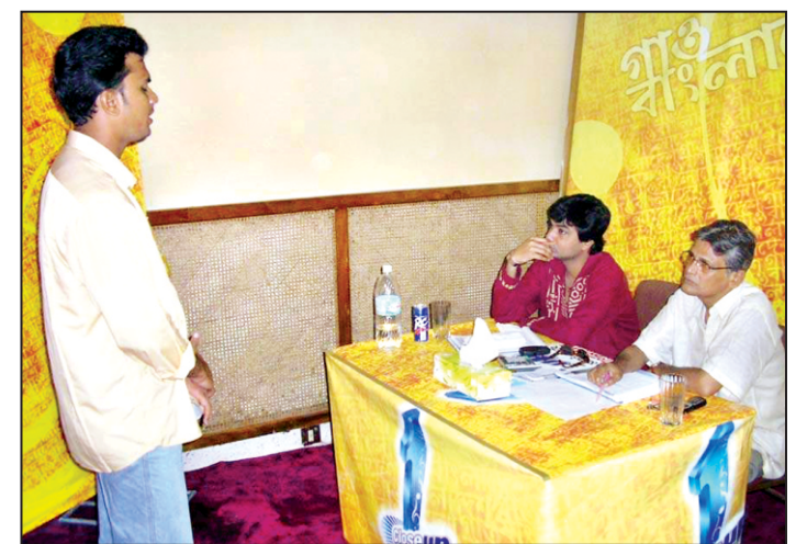
A contestant faces the judges