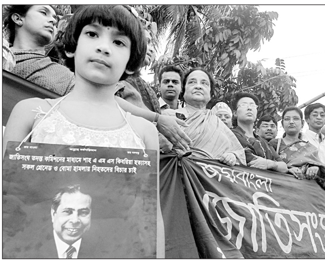
Family of slain former finance minister Shah AMS Kibria and civil society members stage a demonstration as a part of Blue for Peace Programme in front of the Bangabandhu Museum in the city yesterday demanding proper investigation into the killing of the former minister.

According to the fire service, six fire fighting units from different fire stations of the city and the district rushed to the spot and extinguished the fire after two and half hours of efforts.