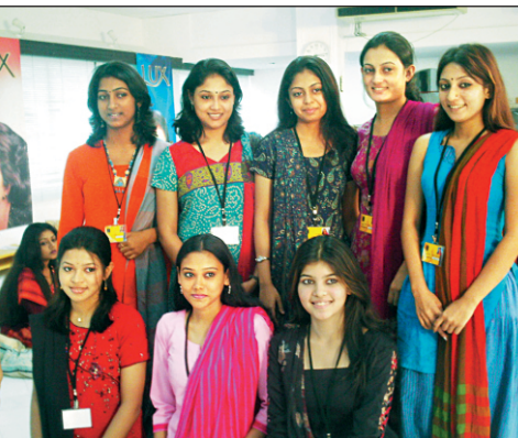
Lux Channel-i Superstar On Channel i at 09:35pm Grooming session of the talent hunt