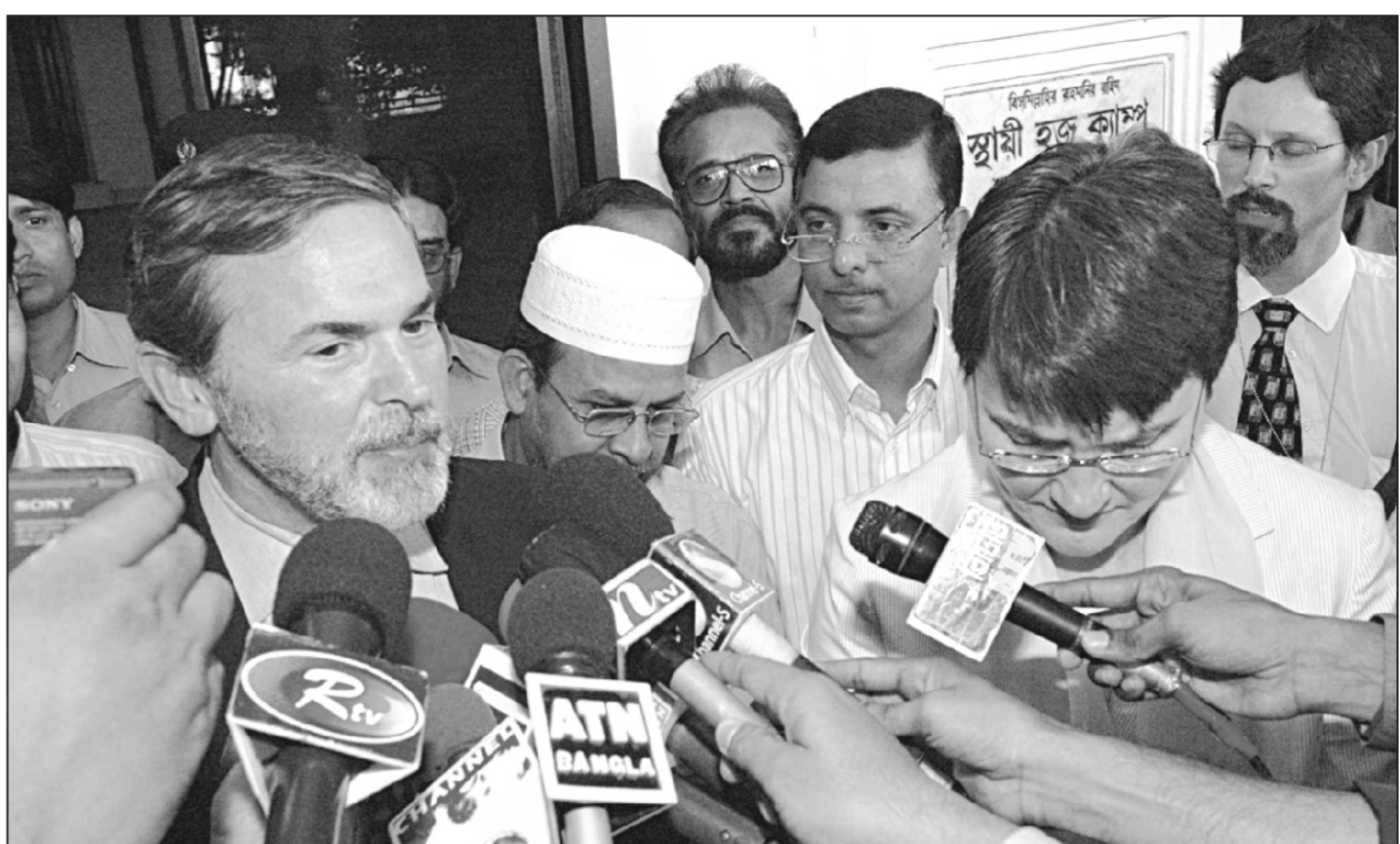
Visiting US Assistant Secretary of State for South and Central Asian Affairs Richard A. Boucher talked to the media after a meeting with Imams at Haji camp at Ashkona. US Ambassador in Dhaka Patricia A. Butenis accompanied him.

In another statement, Ain O Salish Kendra (ASK) condemned the death threat and urged the government to prevent the law enforcers from resorting to human rights violations.