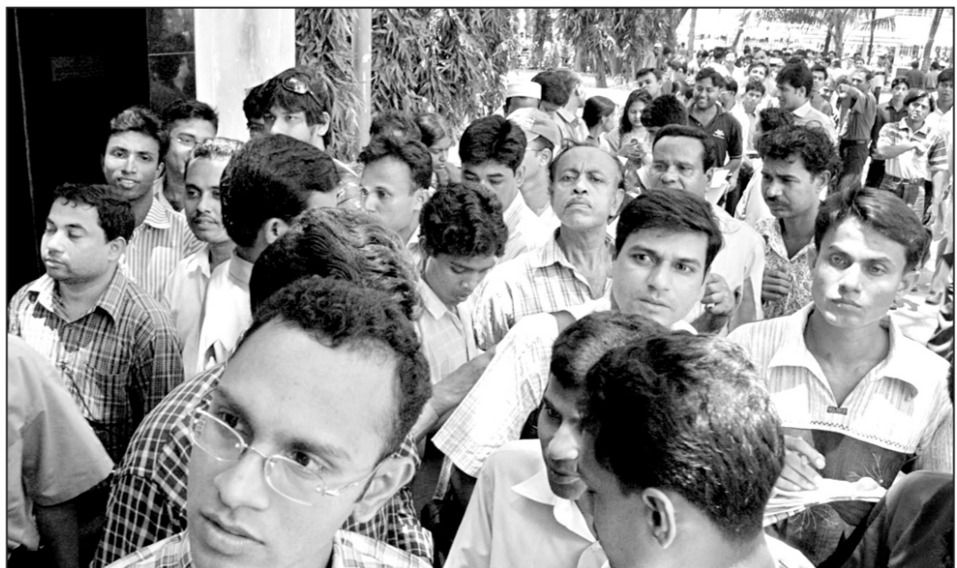
Form seekers crowd the Agrani Bank, Press Club branch yesterday in order to collect the teachers' registration forms under non-government school, college and madrasa.