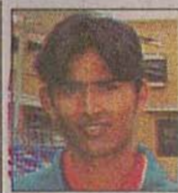
Mashrafee Bin Mortuza

was flayed for 19 runs in the final over as Bangladesh suffered a painful two-wicket defeat against Zimbabwe in the thrilling third one-dayer at the Hatara Sports Club ground on Wednesday.