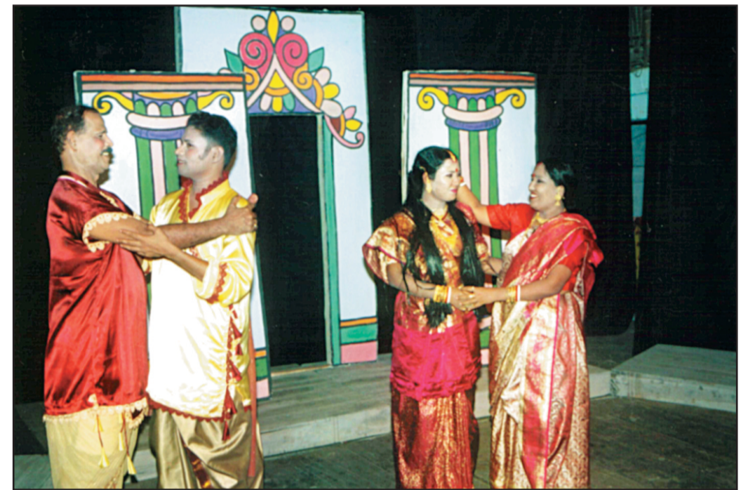
A scene from Padmaboti Panchali, inspired from Monosha Mangol

Even though there's a funds crunch and the government is lackadaisical about extending support to such groups, Barisal Natok is going from strength to strength with its team of dedicated members.