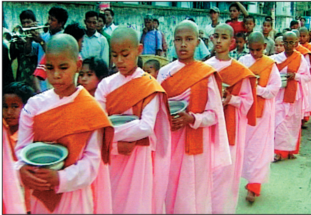
A procession of young Buddhist monks