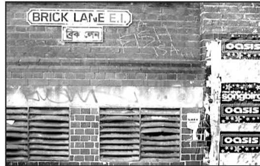
A view of Brick Lane (top), Monica Ali