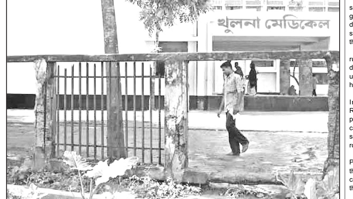
Khulna Medical College Hospital is virtually unprotected as iron robs in the boundary were stolen long ago. The authorities are careless about security even after a recent bomb blast incident in which miscreants tried to kill a patient inside