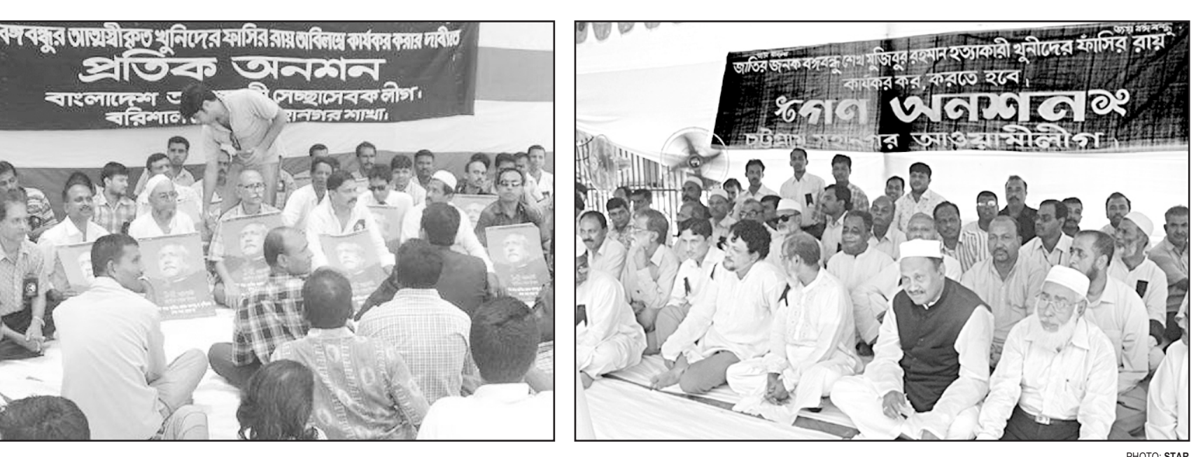
Awami League leaders and activists staged token hunger strike in Barisal (left) and Chittagong as part of a countrywide programme yesterday demanding execution of the verdict in Bangabandhu murder case.