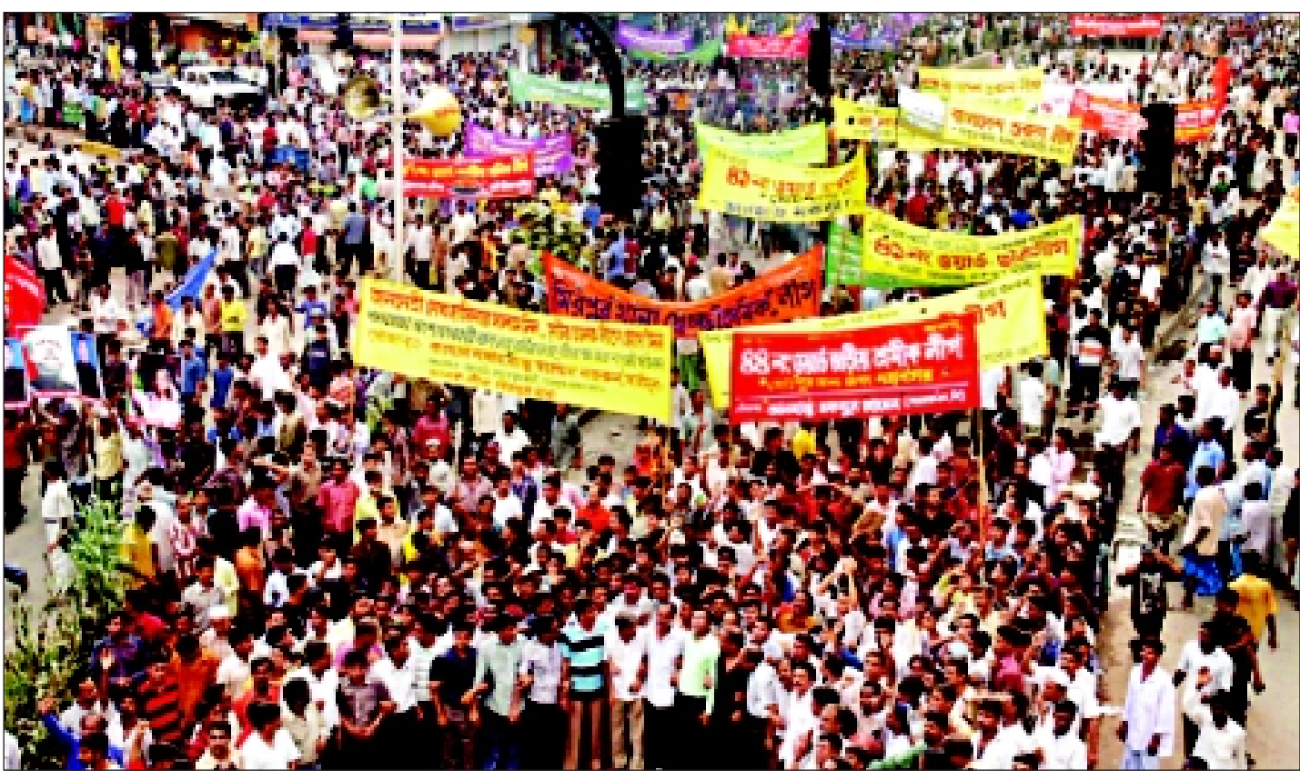
The 14-party opposition combine's road march at Shyamoli intersection in the capital. The procession started yesterday afternoon from Amin Bazar and ended at Russell Square in Dhanmondi.

"Those names will be deleted from the list if the assistant officials can certify it," the EC secretary said. SEE PAGE 15 COL 5