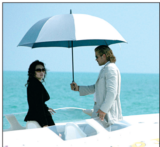
Gong Li and Colin Ferrell in a scene from the movie

Although the show is preposterously dated now and the stuff of clichés, it was groundbreakingly dark for TV when it premiered in 1984. The Miami Vice film won't