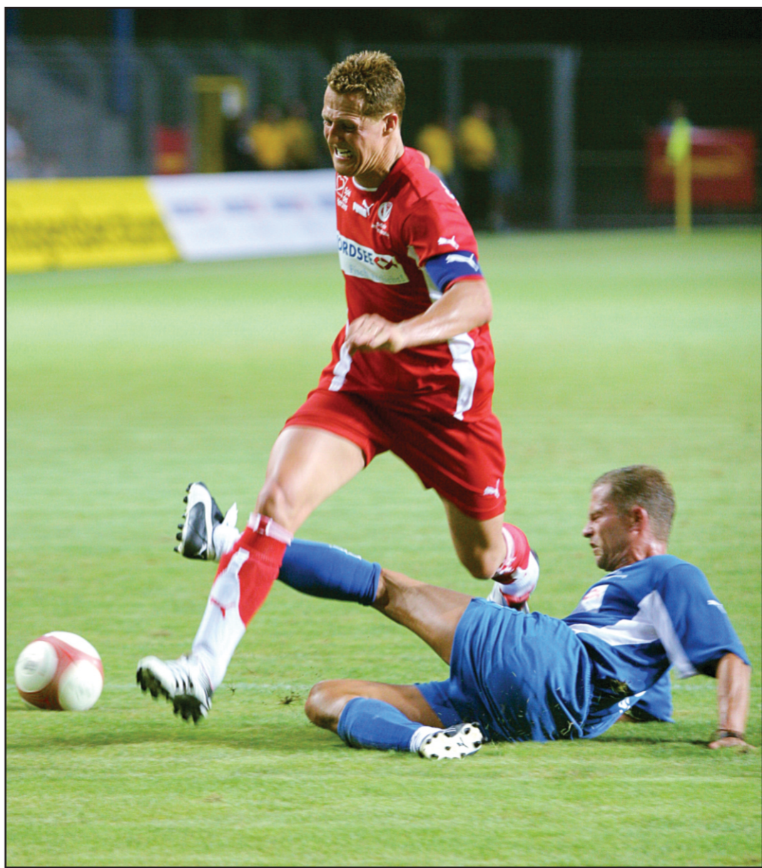
Formula 1 driver Michael Schumacher skips past a challenge during a football match entitled "Spiel der Herzen" (Match for the Hearts) in Mannheim on Wednesday. Benefits from the match was donated to UNESCO.