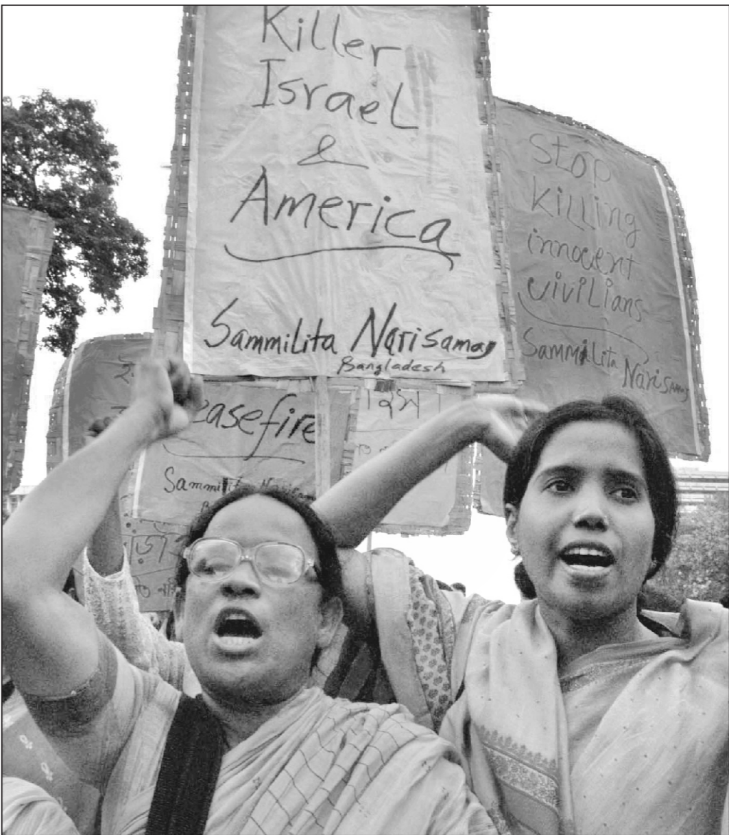
Sammilita Nari Samaj stages a demonstration at Shahbagh intersection in the city yesterday protesting Israeli military offensive against Lebanon.

He conveyed sympathy to the bereaved family members and prayed for the salvation of the departed soul.