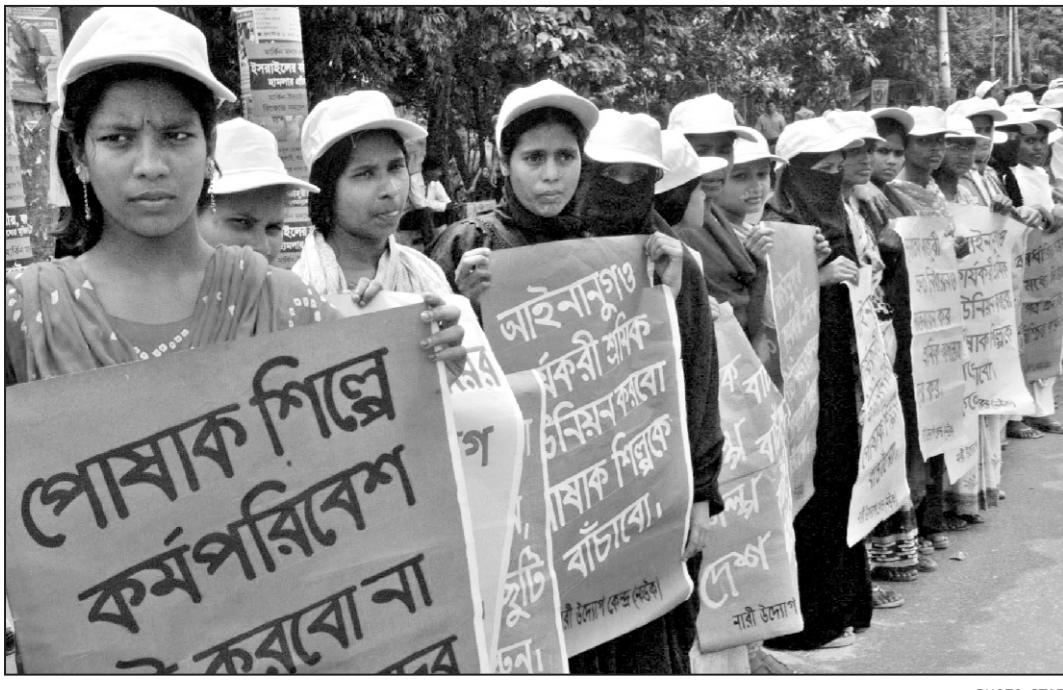
Nari Uddug Kendra, a centre for women's initiative, forms a human chain at Mukhtangan in the city yesterday demanding implementation of the tripartite agreement in the garments sector.