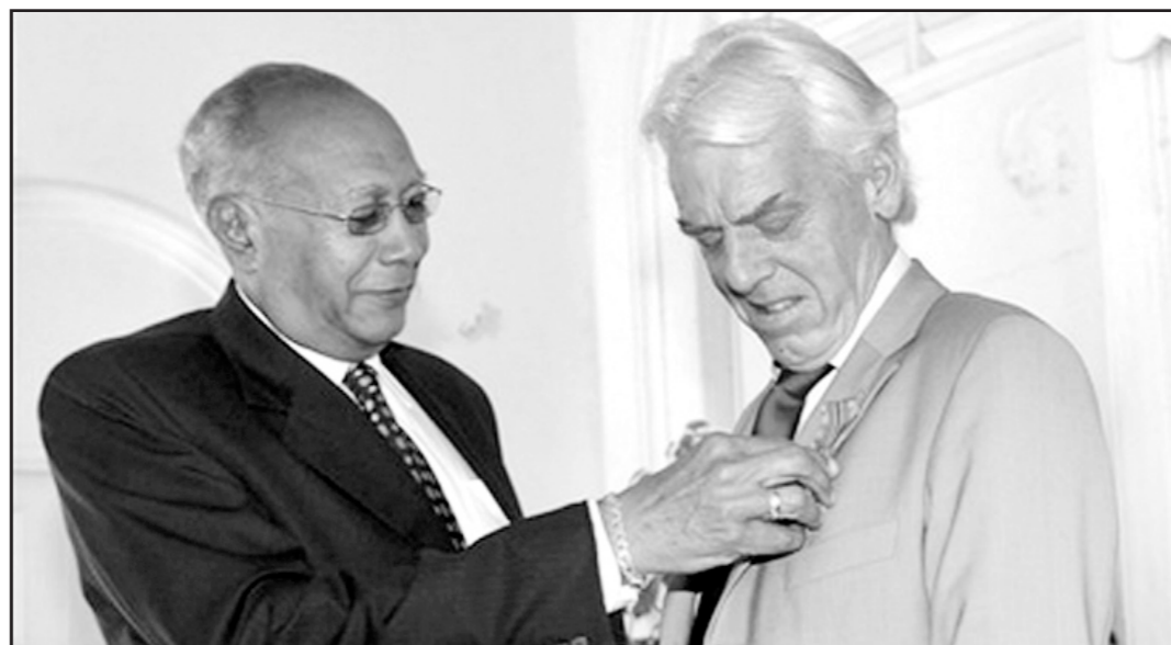
President of Trinidad & Tobago George Maxwell Richards (L) decorates former coach of the island's football team Leo Beenhakker with the Chaconia Gold Medal -- the second highest state honour -- in Port of Spain on Tuesday.

However, Cannavaro and Real clearly believe their marriage has been sealed after he was officially presented to the media. "It's an honour for me to be here," said the Azzurri captain. "I'm enthusiastic about playing for Real Madrid, one of the most important clubs in Europe and the world." "It is incredible to be here, considering that I am 33-years-old," continued the Naples-native. "I hope I will win many titles with Real Madrid." Cannavaro will wear the No 5 shirt, which was Zinedine Zidane's until he retired after Germany 2006 came to an end. "We haven't signed anything," he stated. "We are quoted on the stock market and we must therefore communicate all of our operations. The negotiations are still going on."