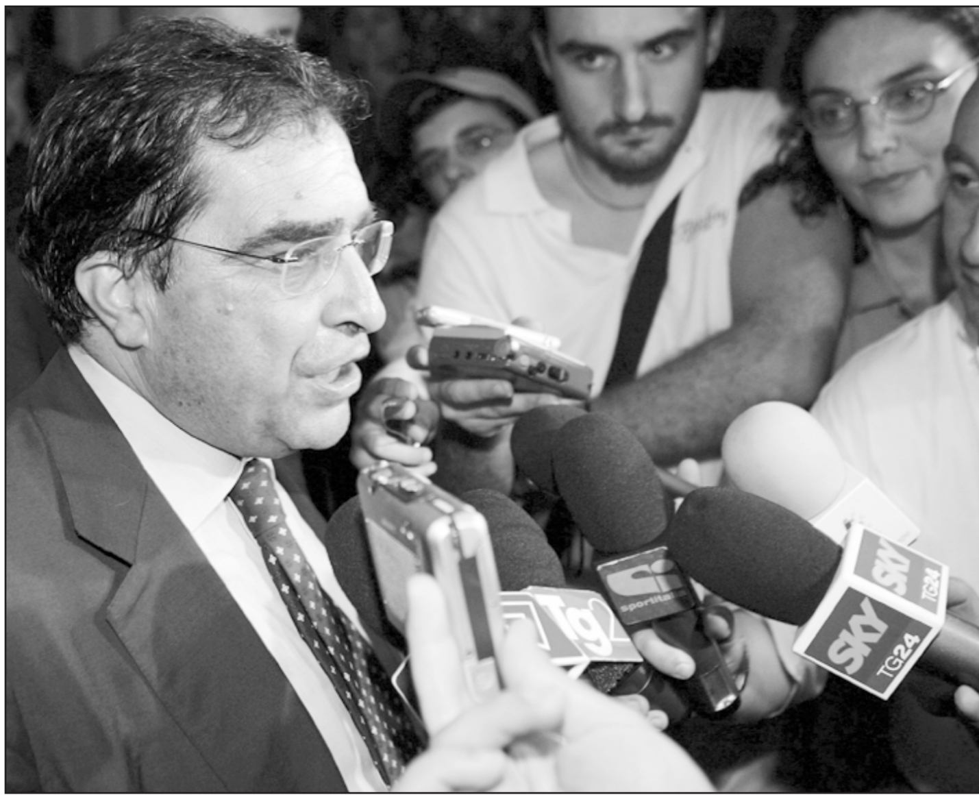
Italian football federation appeal court president Piero Sandulli (L) briefs the press after announcing the result on appeal of Serie A's match-fixing scandal in Rome on Tuesday.