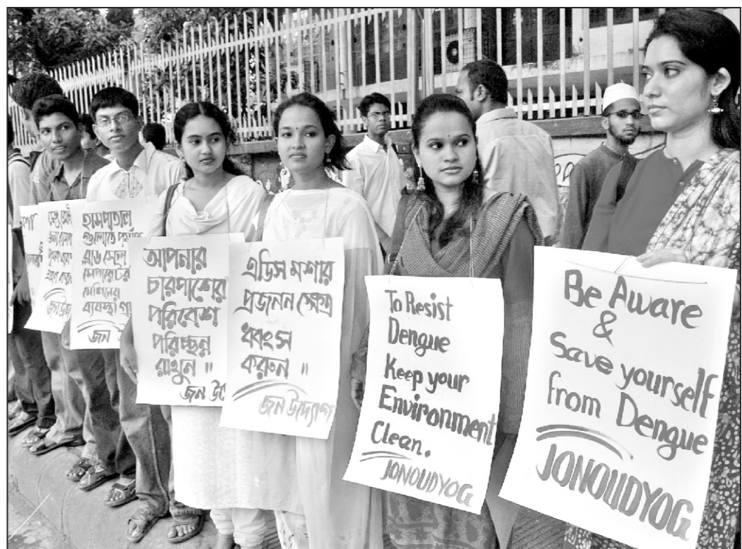
Jono Udyog forms a human chain in front of Fine Arts Institute in the city yesterday with a slogan 'Social awareness to prevent dengue'.