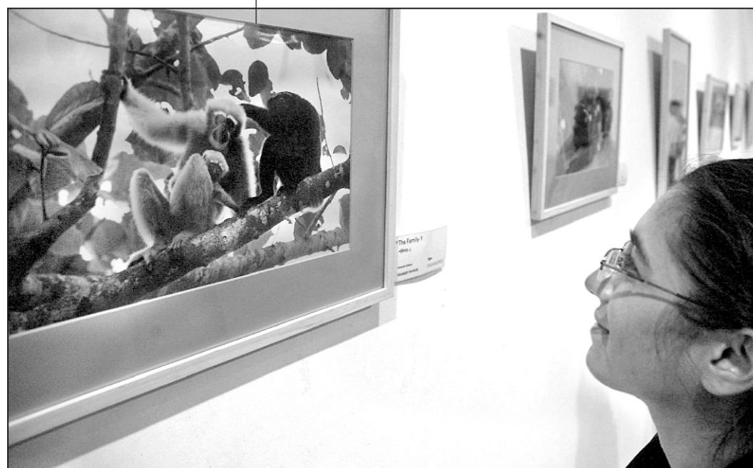
A photography exhibition by Sirajul Hossain begins at the National Museum auditorium in the city yesterday.