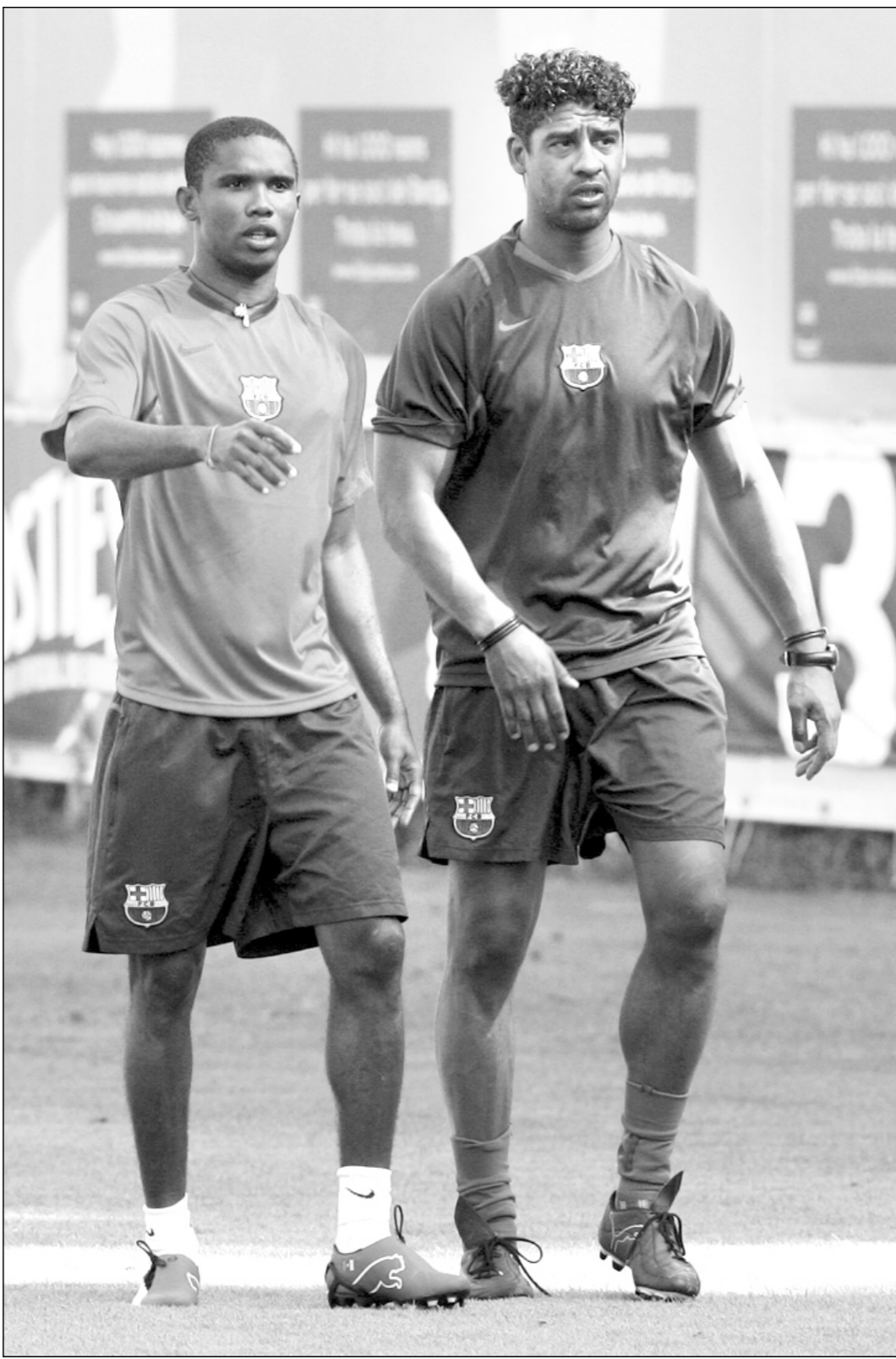
Barcelona's Dutch coach Frank Rijkaard (R) converses with star striker Samuel Eto'o during a training session on Monday in Barcelona.

Juventus have been involved in a match-fixing scandal in Italy and have been ordered to start next season in Serie B on minus 30 points by a tribunal.