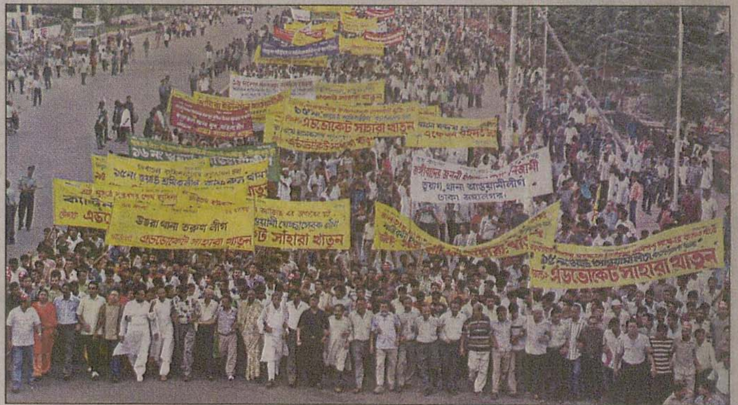
The 14-party opposition combine's road march starting from Abdullahpur in Tongi heads for Mohakhali in Dhaka yesterday.