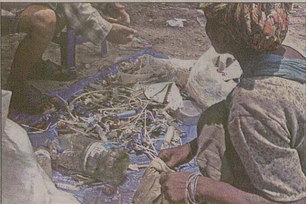
Ragpickers collect medical wastes dumped beside a bin in front of Orthopaedic Hospital at Shyamoli in the capital as they are unaware of the risk of being infected with diseases.