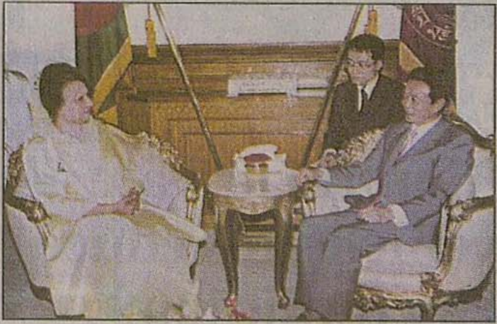
Japanese Foreign Minister Taro Aso calls on Prime Minister Khaleda Zia at her office yesterday.

Speaking at a joint press conference at the foreign ministry follow-