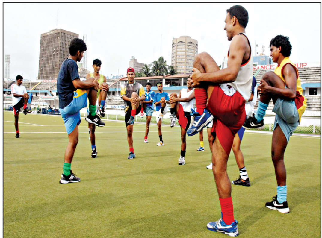
Bangladesh hockey team stretches during a training session at the Maulana Bhasani Hockey Stadium yesterday, ahead of SA Games in Colombo next month.