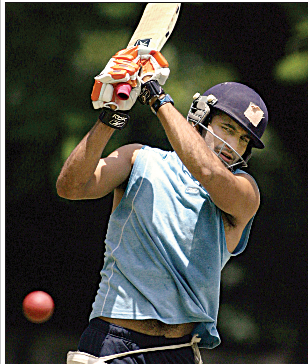
Indian all-rounder Irfan Pathan bats during a practice session at the National Cricket Academy (NCA) in Bangalore on Monday.