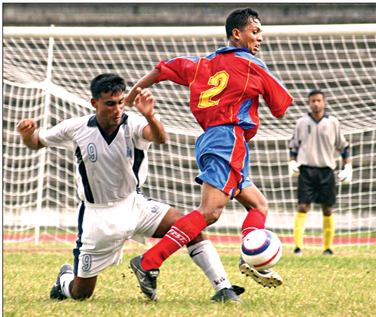
Action from yesterday's services' zone match between Army and Navy in the Jubok Phone National Football Championships at the Army Stadium yesterday.