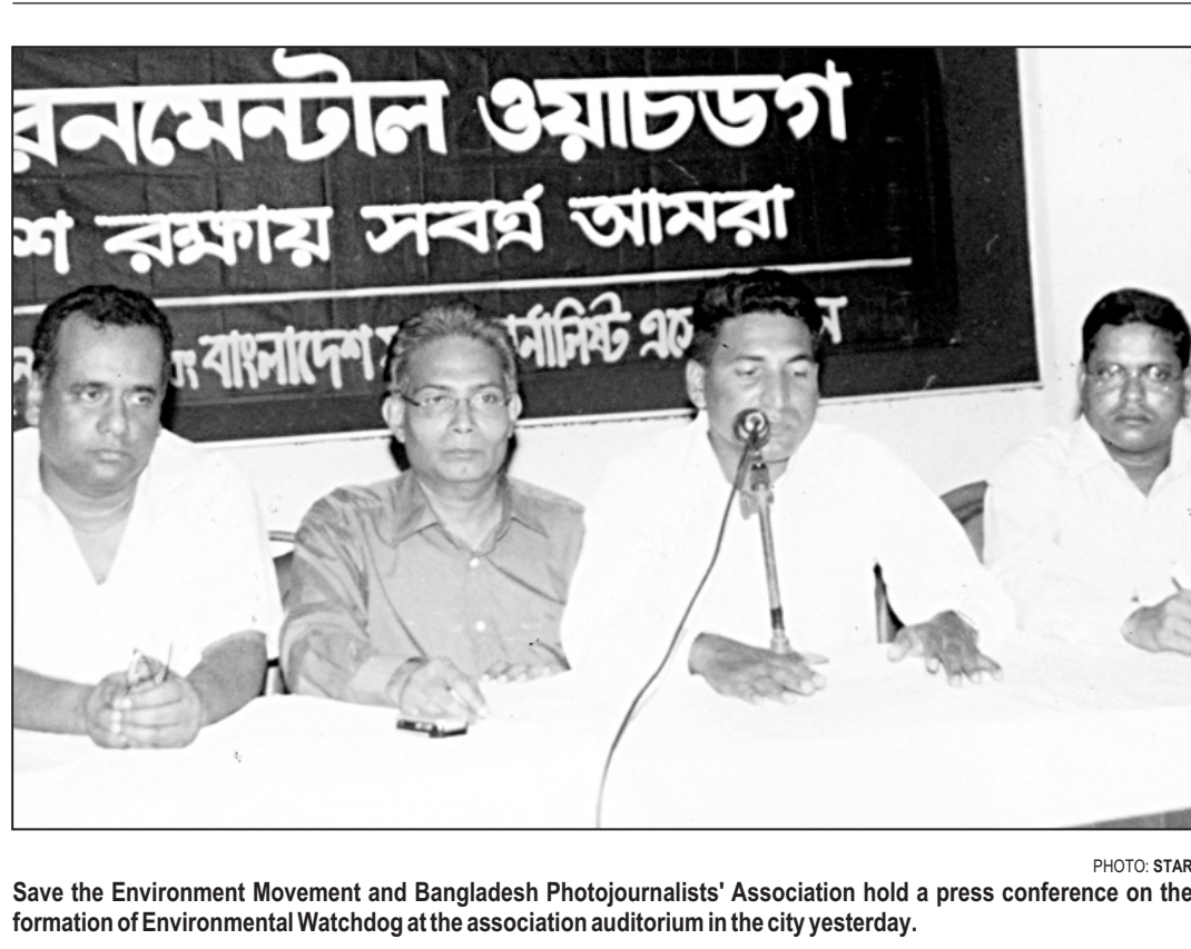
Save the Environment Movement and Bangladesh Photojournalists' Association hold a press conference on the formation of Environmental Watchdog at the association auditorium in the city yesterday.

Their demands include establishment of a truck terminal at a suitable place, development of two central bus terminals, removal of irregularities in toll collection on different bridges of Roads & Highways Department and steps to stop movement of unauthorised trucks and buses.