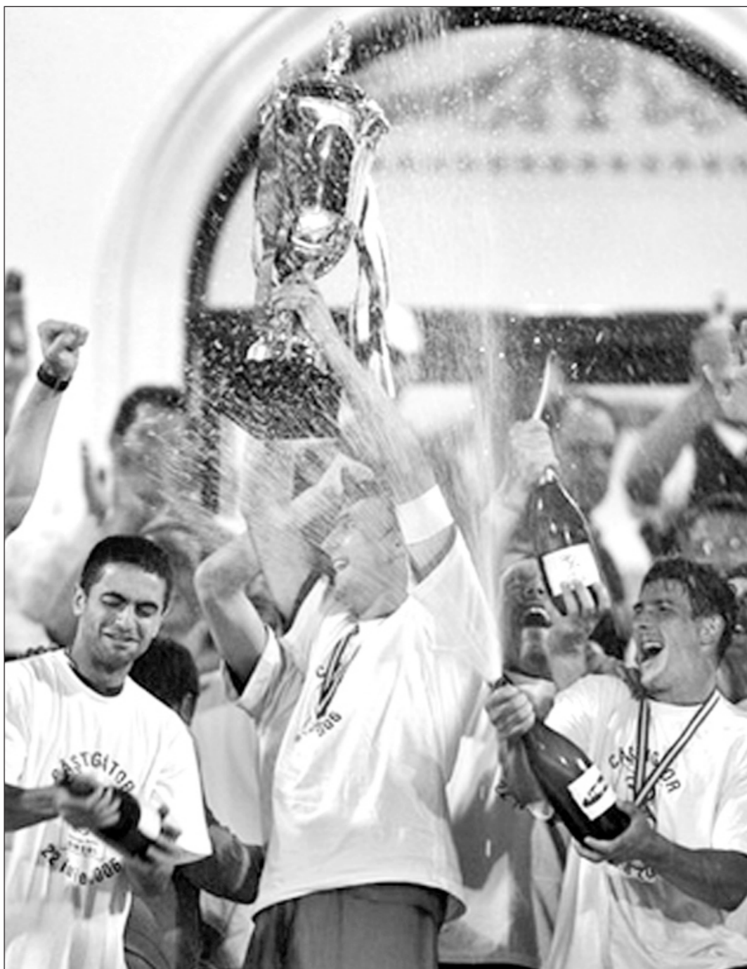
Steaua Bucharest players celebrate winning Romanian Supercup defeating Rapid Bucharest at the Lia Manoliu Stadium in Bucharest on Saturday night. Steaua won the match 1-0.

Maribor progress into the second qualifying round for the UEFA Cup.