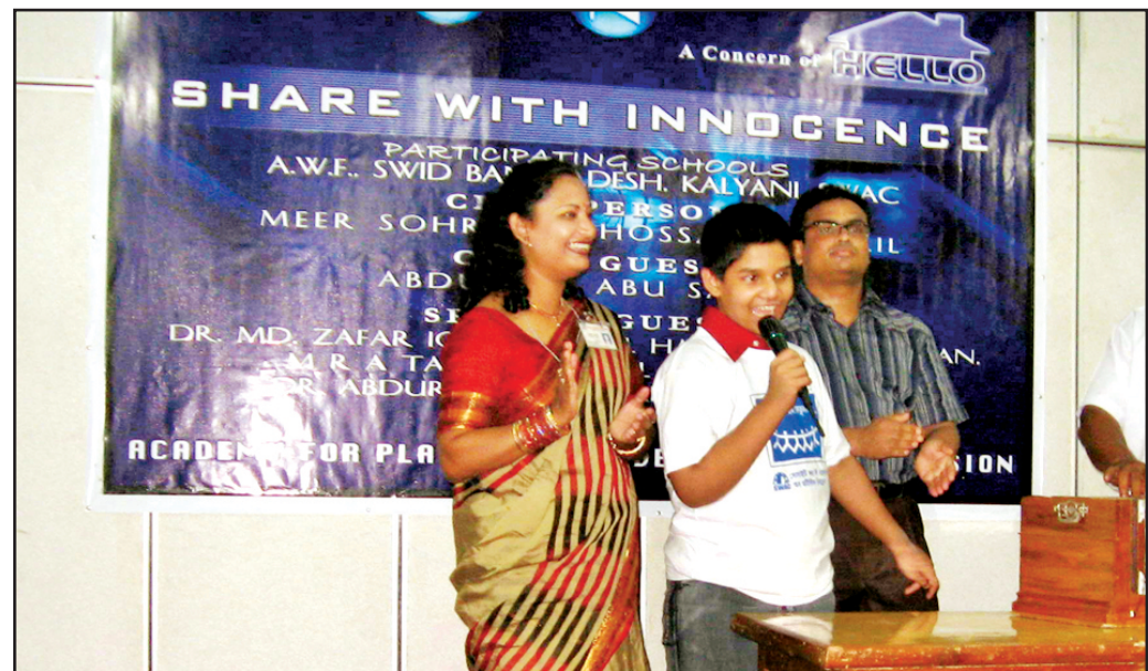
A young one performs at the programme