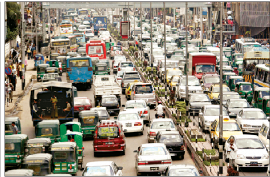
Increasing number of vehicles plying the city streets leaves Kazi Nazrul Islam Avenue in a regular gridlock during the daytime. The authorities are now widening Banglamotor part of the avenue.

As the Rab team reached the spot around 4:00am, Ruhul's accomplices opened fire on them in a bid to snatch Ruhul from their