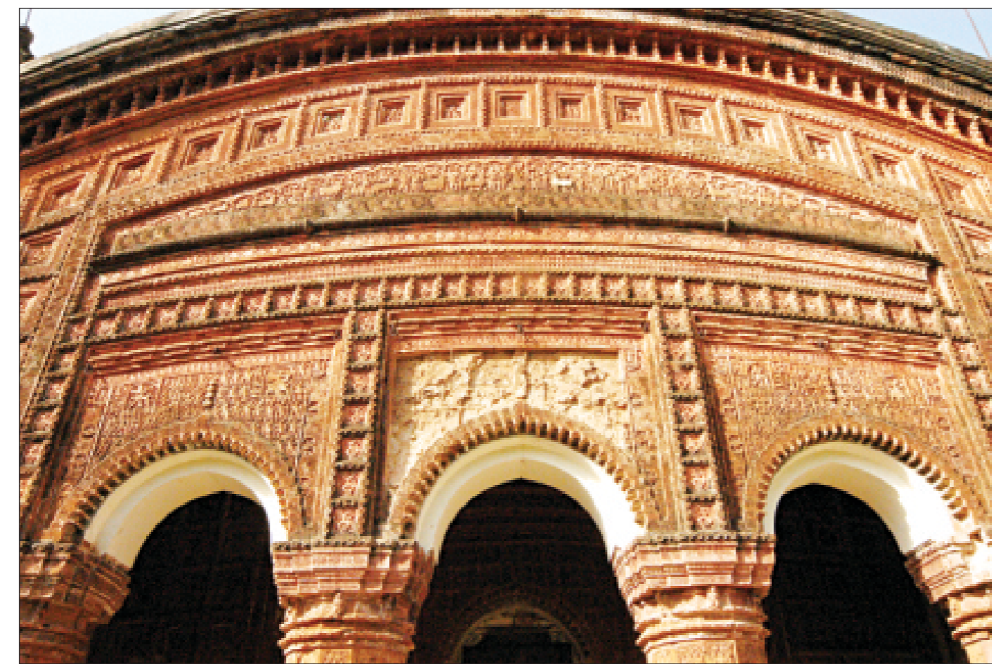
The ancient Annik Mandir in Rajshahi, one of the three temples of Putia Jameendar Bari. The terracotta designs on the temple are being stolen and sold to art collectors, aristocrats and antique shops. The designs tell history through pictures curved on terracotta. These are being torn apart and in some cases an entire block is uprooted from the temple wall. But the authorities turned a blind eye to this theft of invaluable relics.

The board will sit again next week to discuss the issue further.