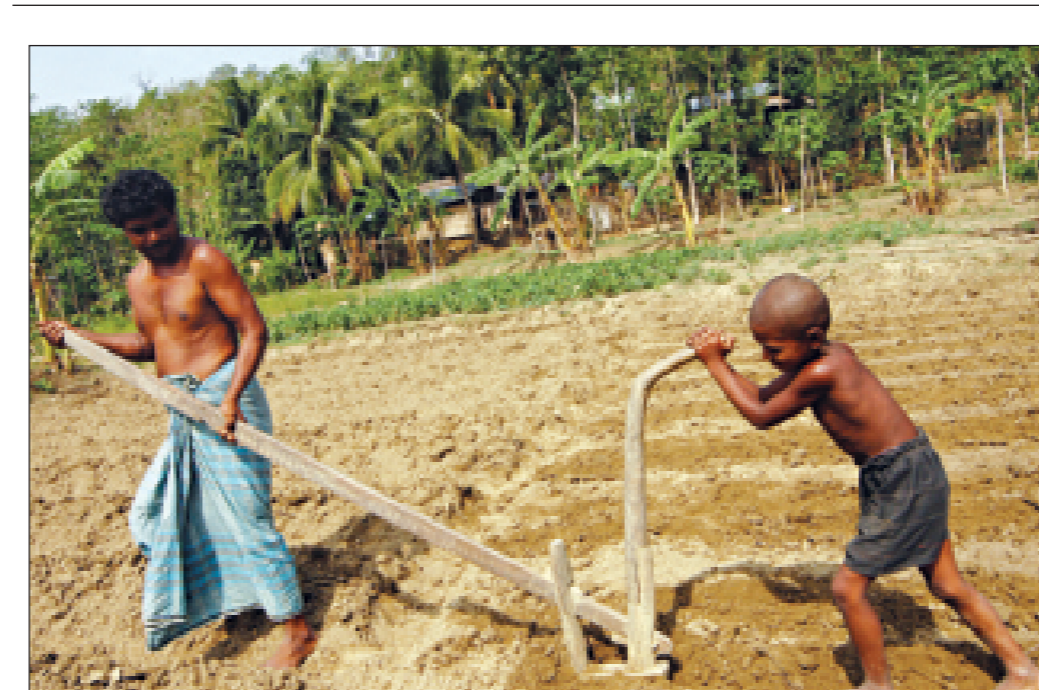
A man ploughs land with the help of his eight-year-old son as he has no cows to pull the plough. The photo was taken from Balaghat near Buddha Bihar in Bandarban.

He succumbed to his injuries on the way to Chittagong Medical College Hospital.