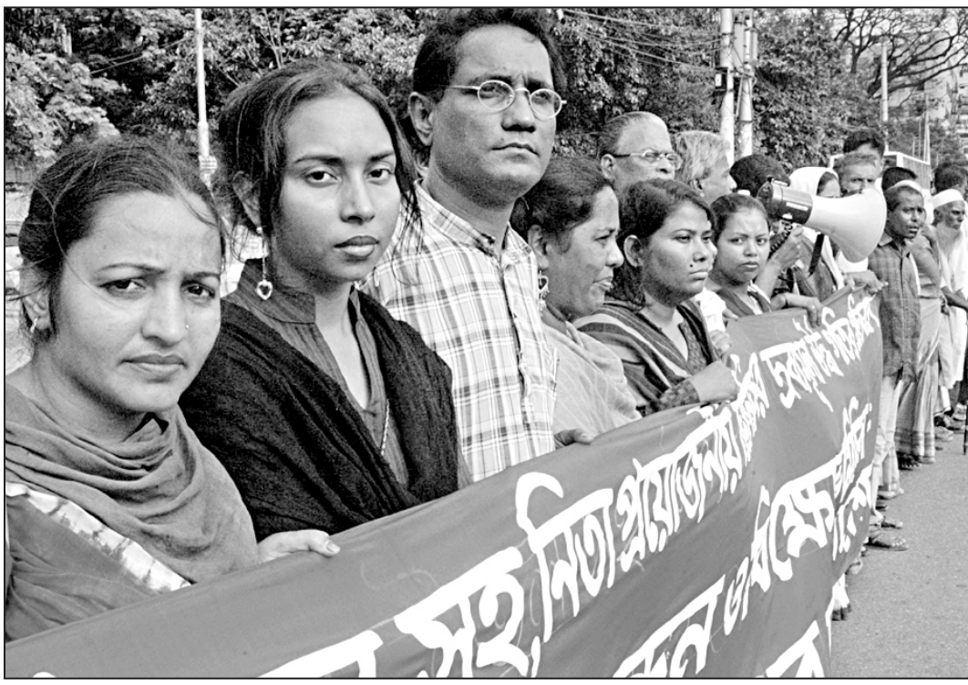
Members of the Bangladesh Grameen O Nagar Daridra Federation line up at Mukhtangan in the city yesterday protesting the price hike of essentials.

On the occasion, recitation from the Holy Quran and milad mahfil have been arranged at her residence at Shajahan Road, Mohammadpur after Asr prayers today. Admirers are requested to attend the programmes.