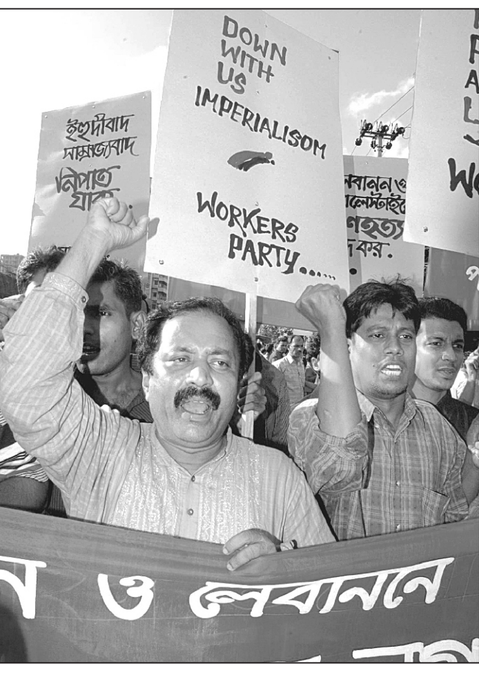
Bangladesh Workers' Party stages a demonstration at Mukhtangan in the city yesterday protesting Israeli military offensive against Lebanon.