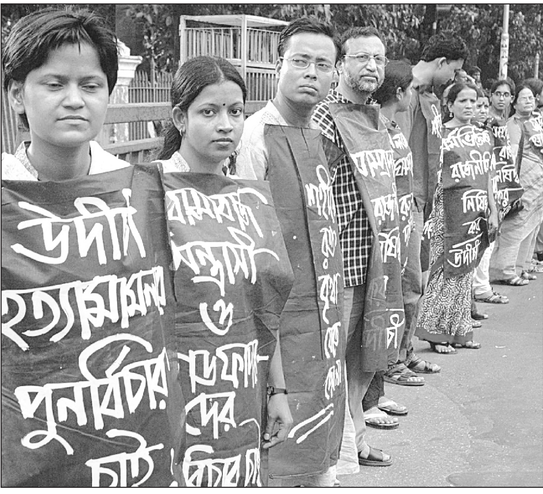
Udichi forms a human chain in front of the High Court in the city yesterday demanding fresh investigation and trial of the Udichi blast case.

On the occasion, different socio-political and cultural organisations have chalked out various programmes. Colonel Taher Sangsad will organise a discussion titled 'Trial of Colonel Taher killing: Movement and legal procedure' at Teacher Student Centre (TSC) at Dhaka University at 4:00pm.