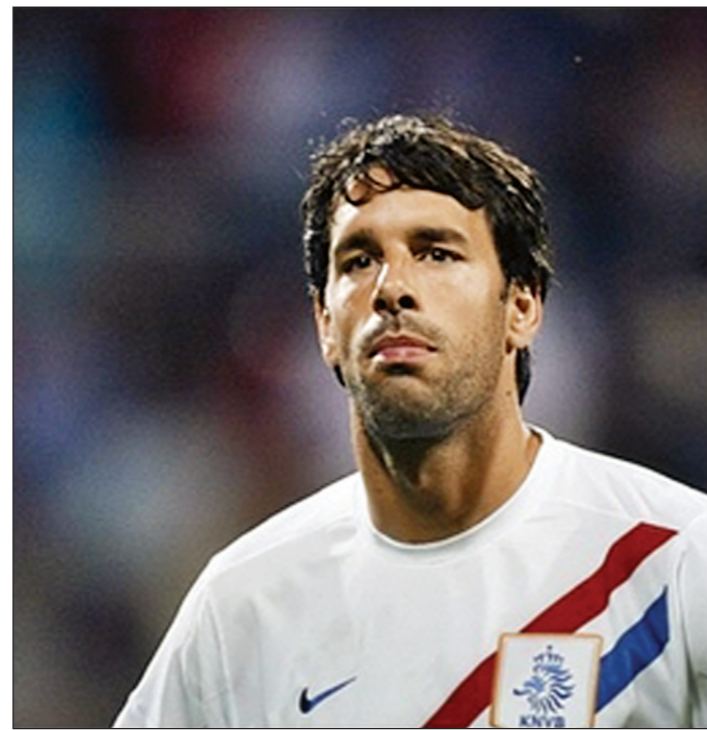
RUUD VAN NISTELROOY