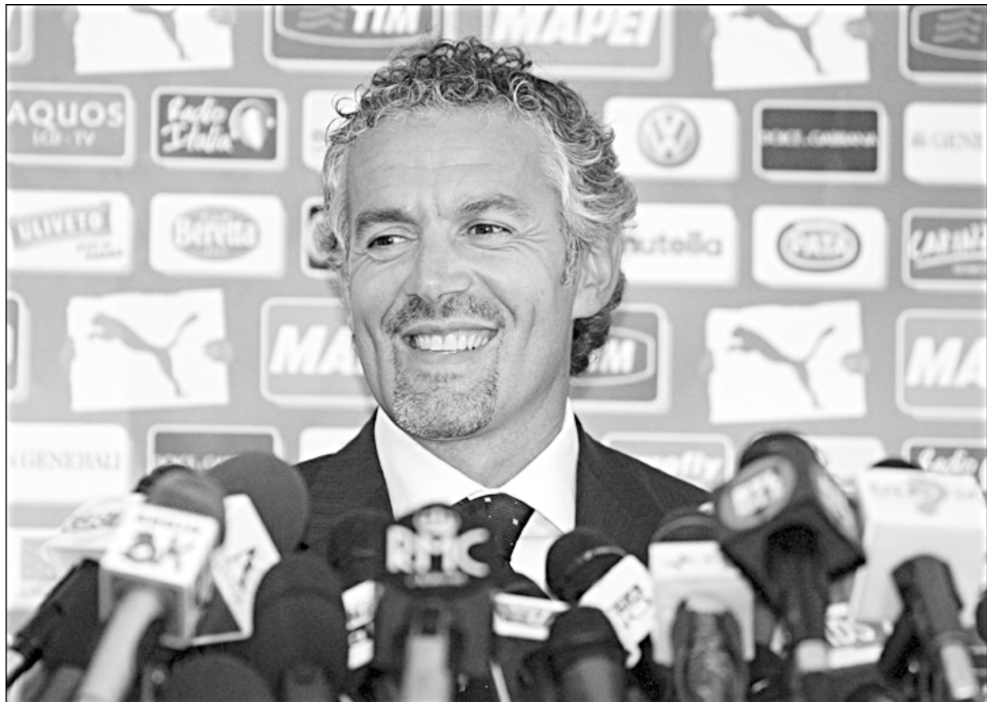
Roberto Donadoni smiles as he talks with the press at a Rome hotel on Tuesday during his official presentation as the new coach of world champions Italy.