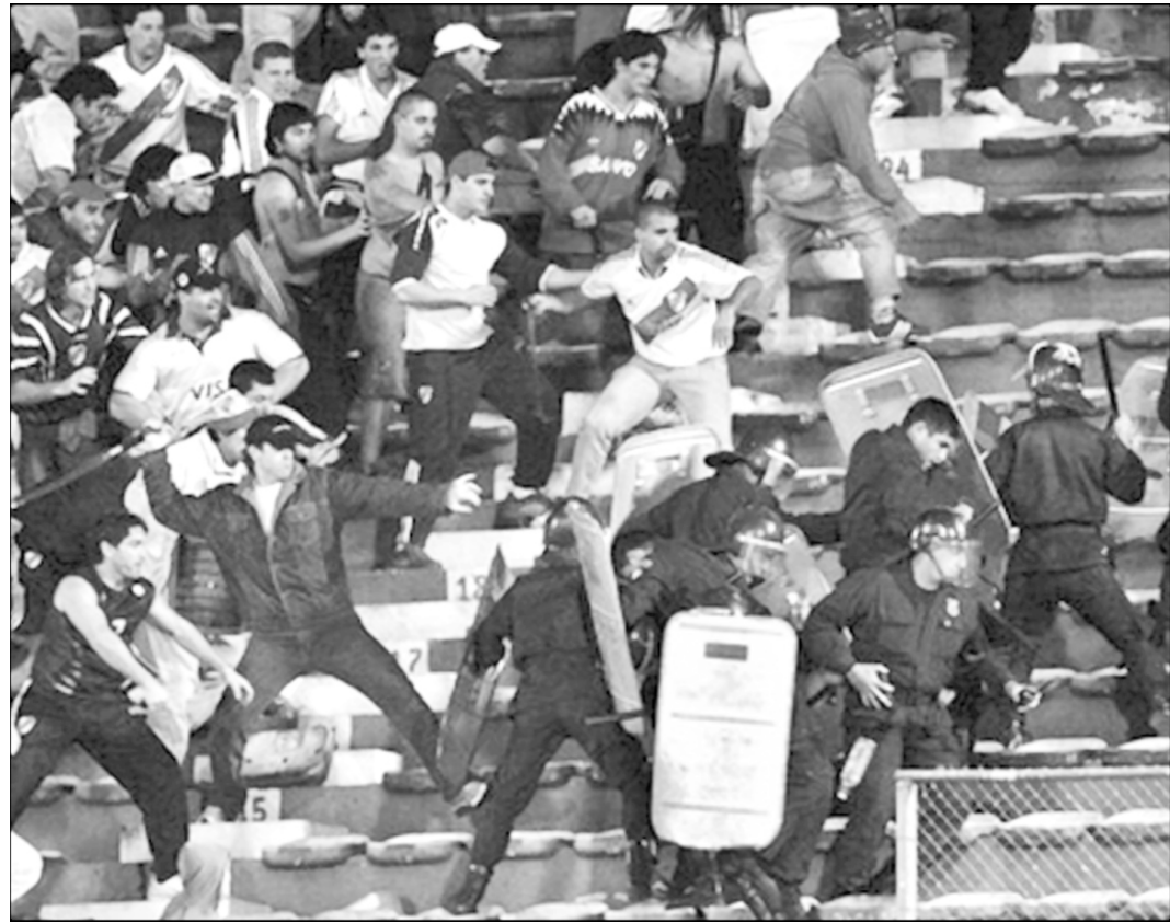
River Plate fans confront the police during their quarterfinal match against Libertad in the Copa Libertadores at the Defensores del Chaco Stadium in Asuncion on Tuesday.