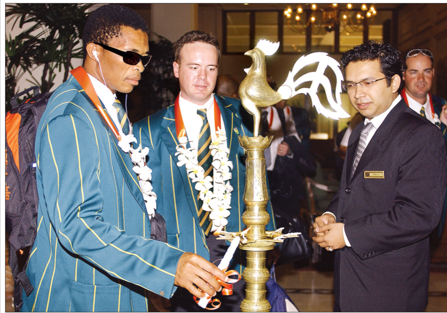
South African paceman Makhaya Ntini (L) lights a traditional oil lamp as he, along with the rest of the team, arrives at the team hotel in Colombo on Wednesday.