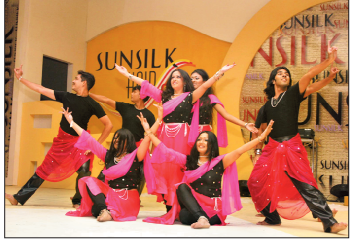
Dancers perform at the event