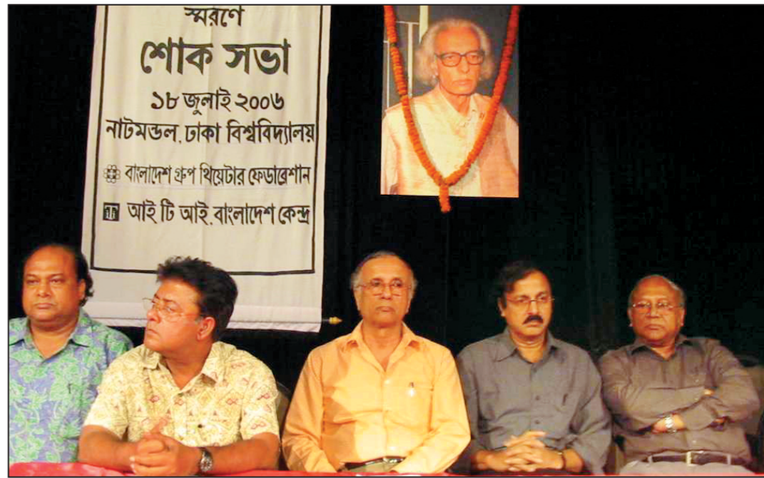
Discussants at the programme