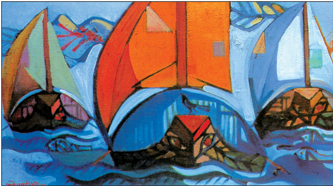
High Tide (Top) and Freedom Fighter