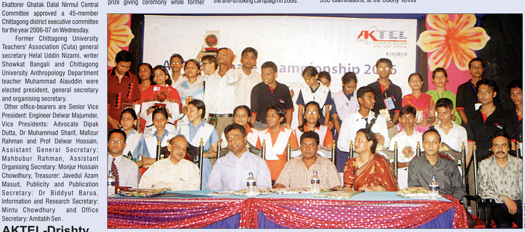
Winners of Aktel-rishty Debate Competition pose for photograph with the guests at Chittagong Shilpakala Academy on Thursday.