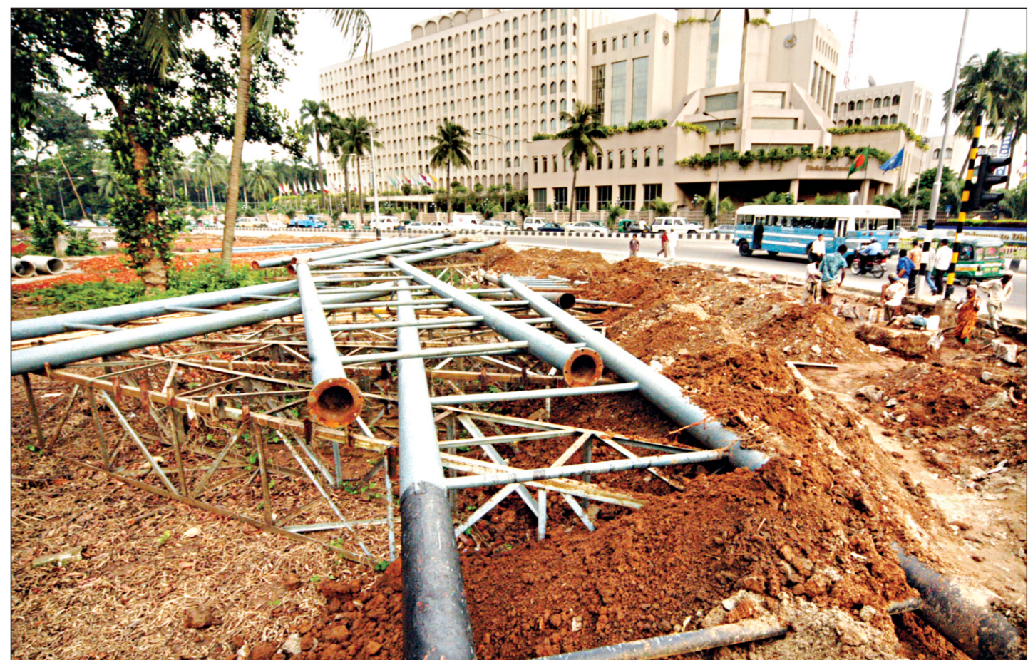
Billboards in front Dhaka Sheraton have been torn down as part of the DCC drive.