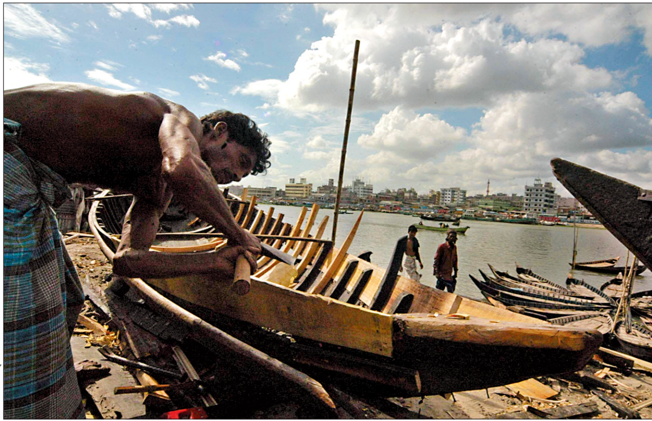
Boatmen on the riverside are busy making new boats and repairing the old ones, worn out during the rainy season, which is almost drawing to a close.