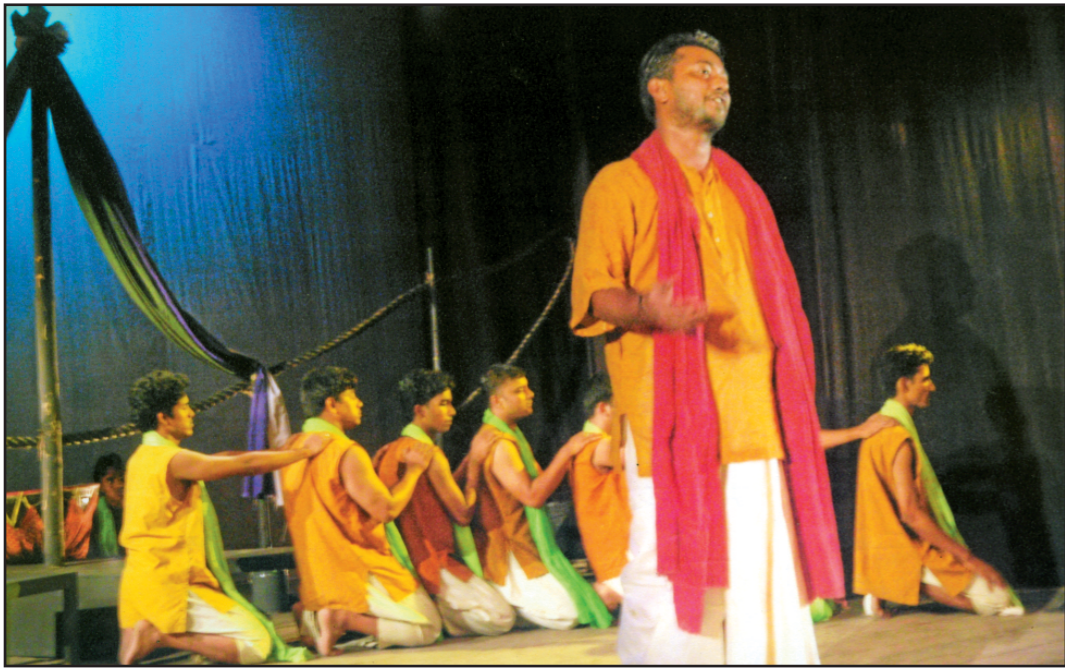
A scene from the play