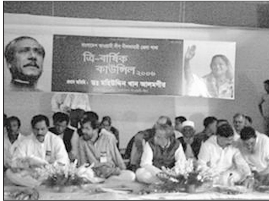
Central and local Awami League leaders during council of Nilphamari unit of the party yesterday.

The speakers said politics is now virtually being controlled by use of money and muscle power. This must change to bring in honest and dedicated people to politics. Political parties should realise this to ensure good governance, they said.