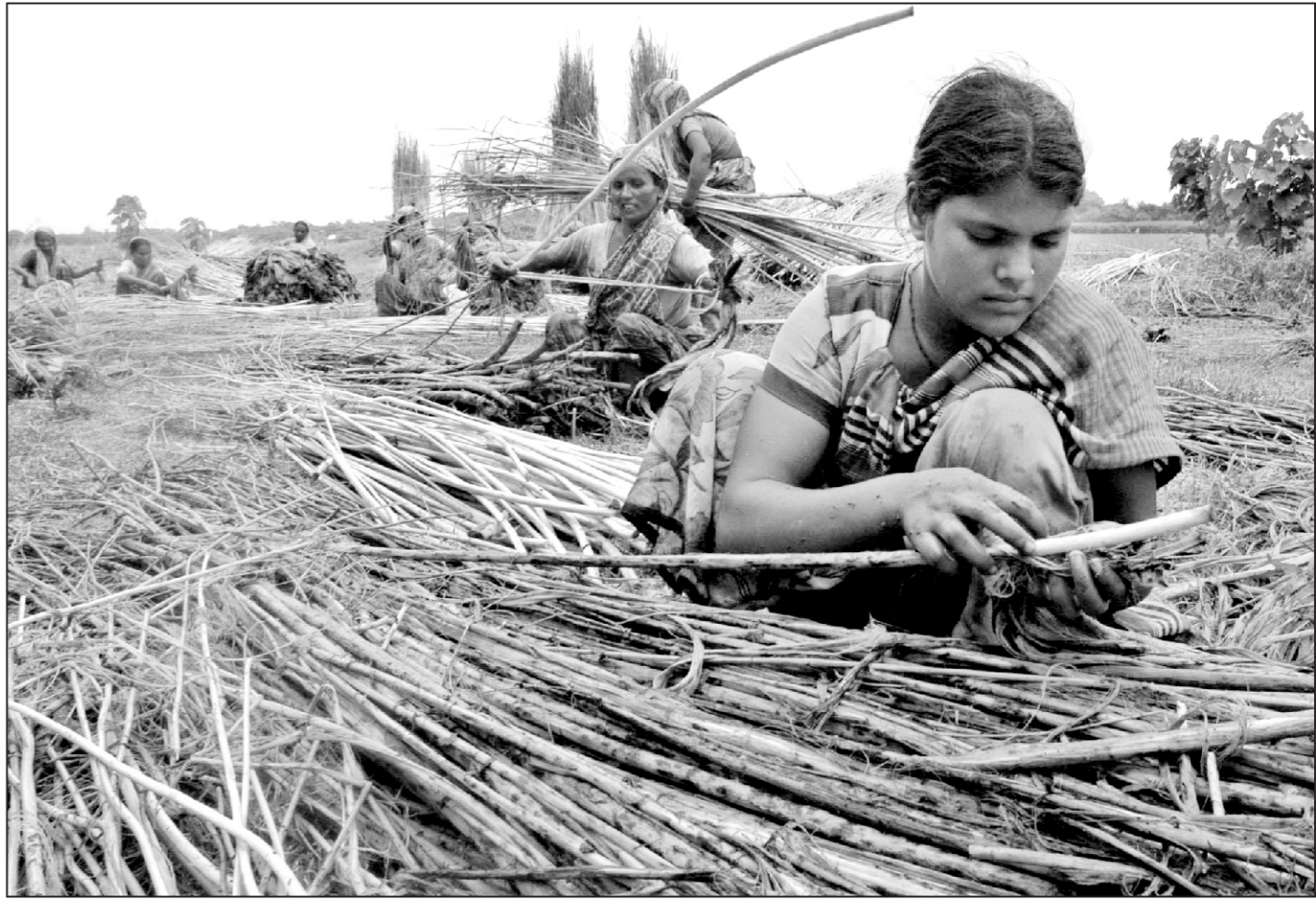
Female workers are peeling fibres from water-soaked jute plants at the landowners' fields for which they will receive the jute sticks only as remuneration. The picture was taken from Mawa in Munshiganj yesterday.

Friends, relatives and admirers have been requested to attend the programme and pray for the salvation of the departed soul.