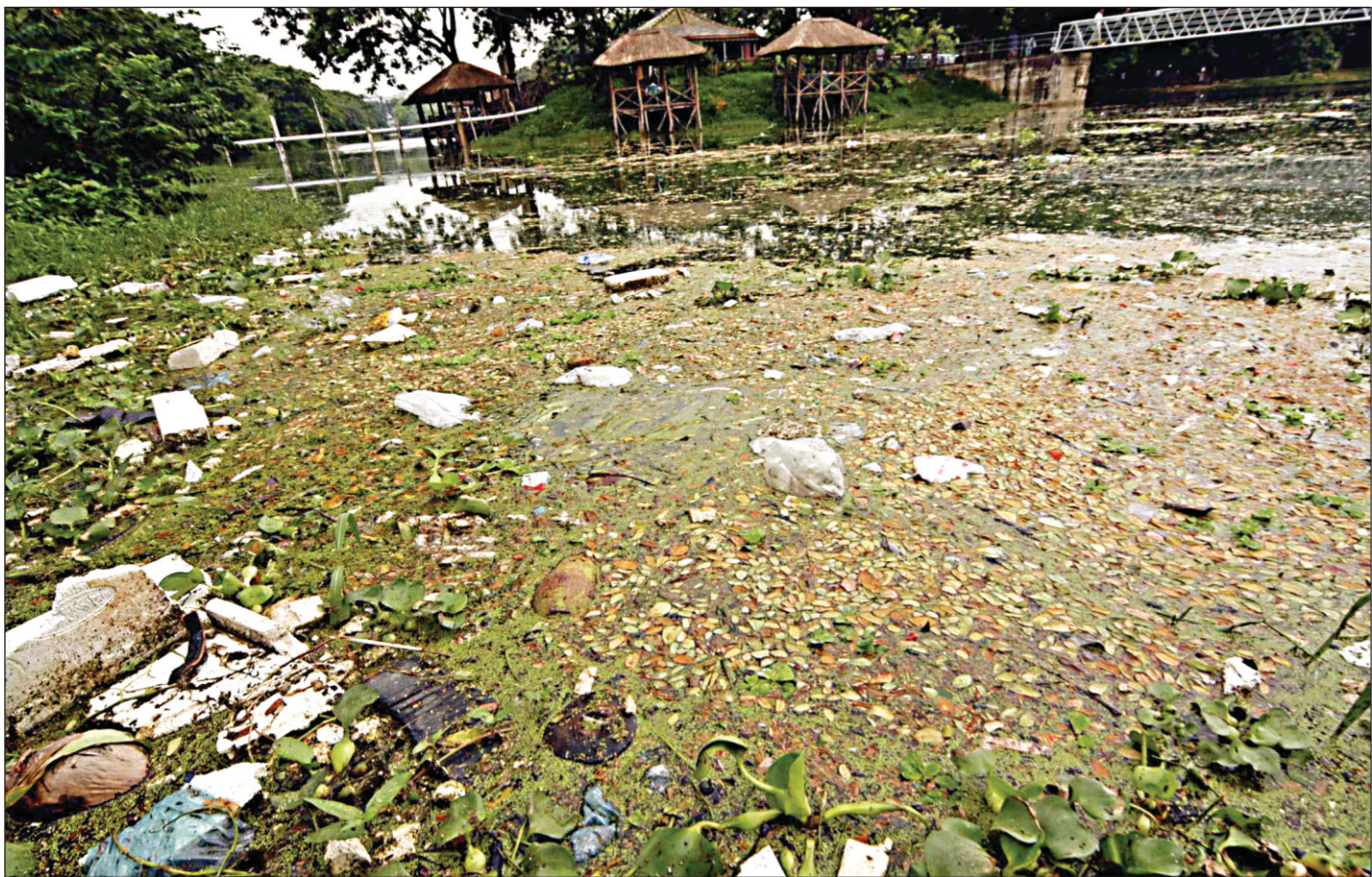
Dhaka City Corporation takes no notice as wastes dumped in Dhanmondi Lake are polluting water.

Opposition leader Sheikh Hasina yesterday urged the people to prepare lists of the ministers, MPs and local leaders of the alliance government who "plundered" public money. "The BNP-led coalition government wants to stay in power through election engineering to enjoy the illegal money... People will have to foil the evil design of the government," she said. Hasina, also the president of Awami League (AL), made the remarks while exchanging views with the party's grassroots level leaders of Rangpur and Pabna districts at AL's Dhanmondi office. She alleged that the government had earned Tk 2.86 lakh crore during the last four and a half years by increasing the prices of essentials.