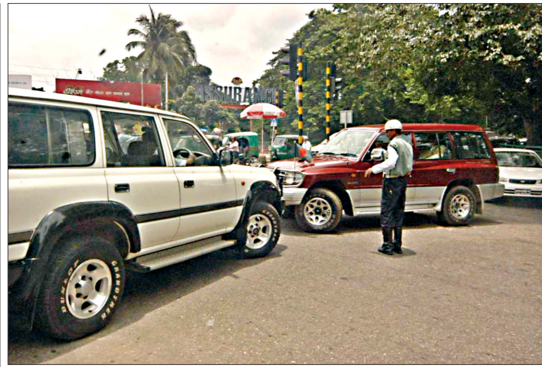
A minister's SUV (red and silver) narrowly escapes a head-on collision with another vehicle as it takes an illegal turn in front of the chief justice's residence at Kakrail in the capital yesterday.

Gono Forum President Dr Kamal Hossain yesterday said the process of grand national consensus among Awami League (AL)-led 14-party coalition, Gono Forum, Bikalpa Dhara Bangladesh (BDB) and Bangladesh Tarikat Federation is underway as they will work together to defeat the BNP-Jamaat alliance in the next general elections. "It is a good news for the nation that all progressive and pro-liberation forces are being united on the basis of the 14-party's 23-point proposal. Now we are working to form a grand national consensus for safeguarding the democracy, people and nation from the grip of BNP-Jamaat-led four-party alliance government," the Gono Forum President said at a