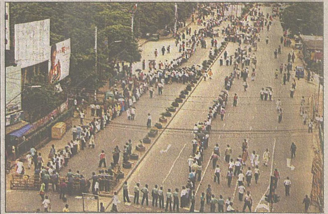
Shikkhak Karmachari Oikya Jote activists block the road from Purana Paltan intersection to Zero Point in the capital yesterday as they form a human chain demanding nationalisation of their jobs.

The government has decided to remove the anomalies in the National Pay Scale to increase the salaries of the government primary school teachers. A meeting of the cabinet committee on salary fixation yesterday took the decision and also approved some recommendations made by a secretary committee to increase the basic salary of the government primary teachers. Finance and Planning Minister M Saifur Rahman chaired the meeting held at the secretariat. The decision to raise the salaries will be effective from the current month and the teachers will enjoy its benefits from next month. An additional amount of Tk 75 crore will be required for the purpose. Grade wise basic salary for