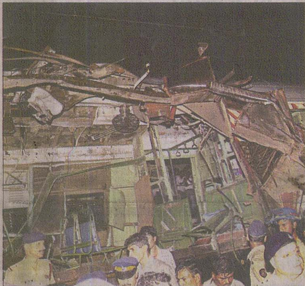
Police and onlookers stand around the mangled compartment of one of the blast affected local trains in Mumbai yesterday. Several blasts in local train compartments rocked the city which has so far claimed around 160 lives.