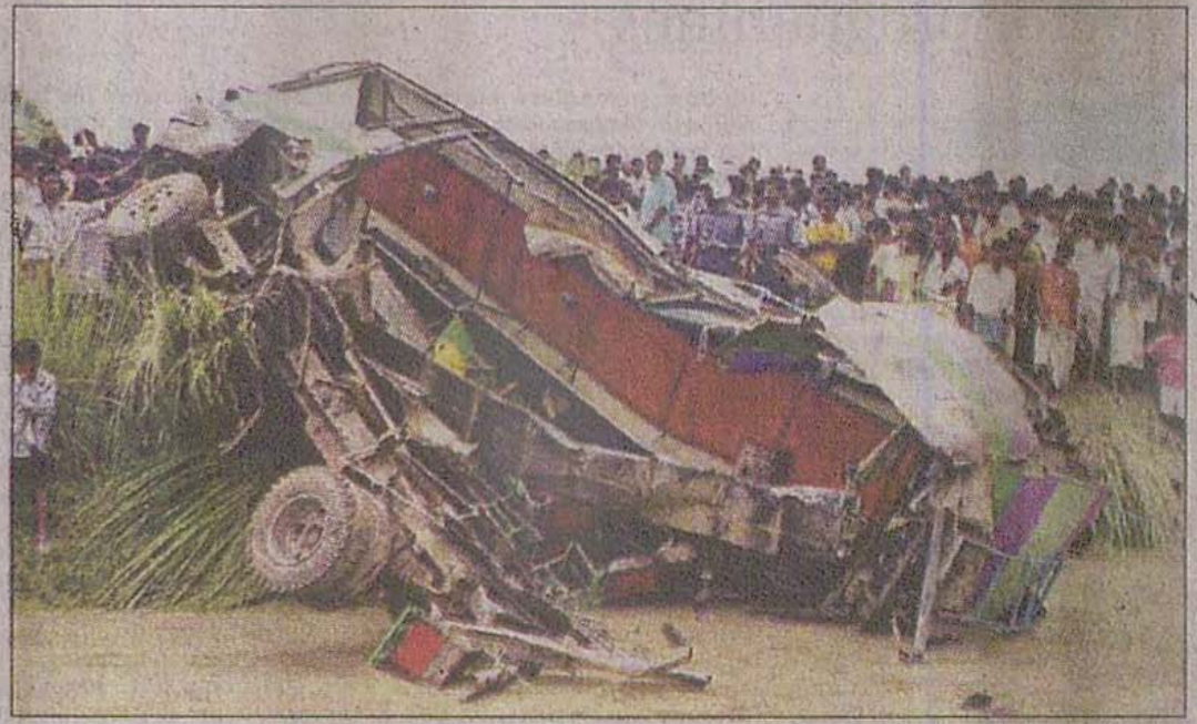
The wrecked bus that was rammed by a train at a level crossing at Akkelpur in Joypurhat yesterday.

The blasts occurred on five trains and at two stations in