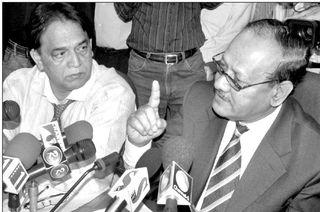
LGRD Minister Abdul Mannan Bhuiyan speaks at a press conference at the conference room of the ministry in the city yesterday.

Speakers at a roundtable yesterday underscored the need for raising awareness to establish the rights to reproductive health of women as human rights. They also called for changing social attitude towards women to safeguard reproductive health rights. The Health Rights Project, Population Services and Training Centre (PSTC), in association with the daily Samakal organised the roundtable on 'Reproductive health rights of women' at the National Press Club in the city to mark the World Population Day.