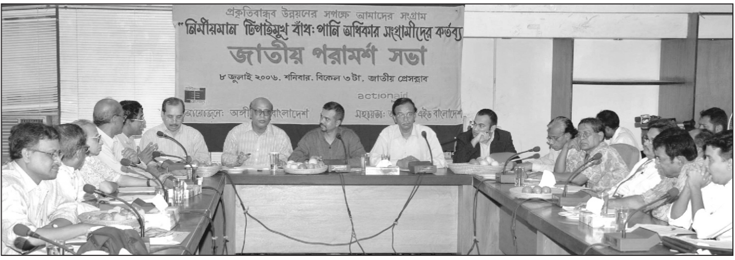
Participants at a national consultation meeting on 'Under-construction Tipaimukh Dam project: Responsibilities of water rights activists' held at the National Press Club in the city yesterday.

A garment worker was gangraped at Gazipur yesterday.