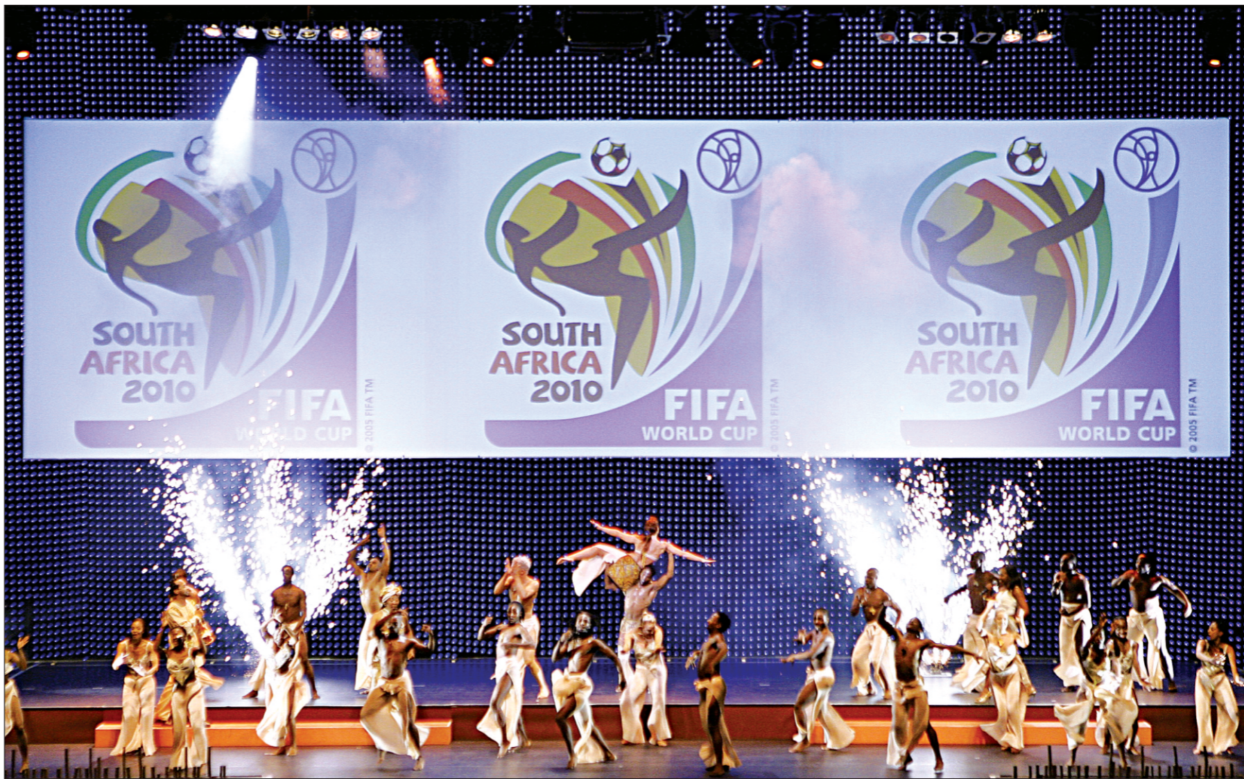
Dancers perform during a glittering function to unveil the official logo of the FIFA World Cup South Africa 2010 in Berlin on Friday.

"The South African World Cup will also be part of a big initiative we are taking in FIFA by saying 'win in Africa with Africa,'" Blatter said, saying the sport had a duty to take on social responsibility in human development.